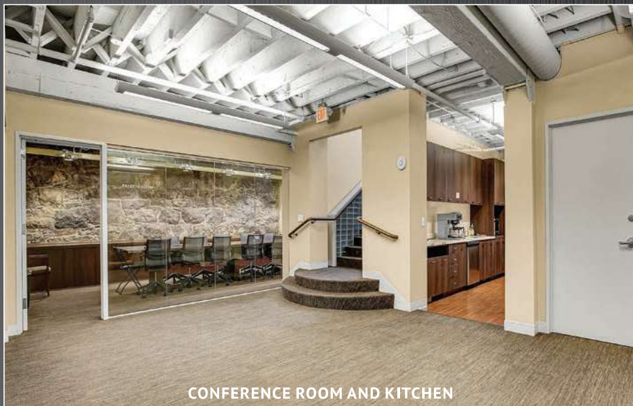
CONFERENCE ROOM AND KITCHEN