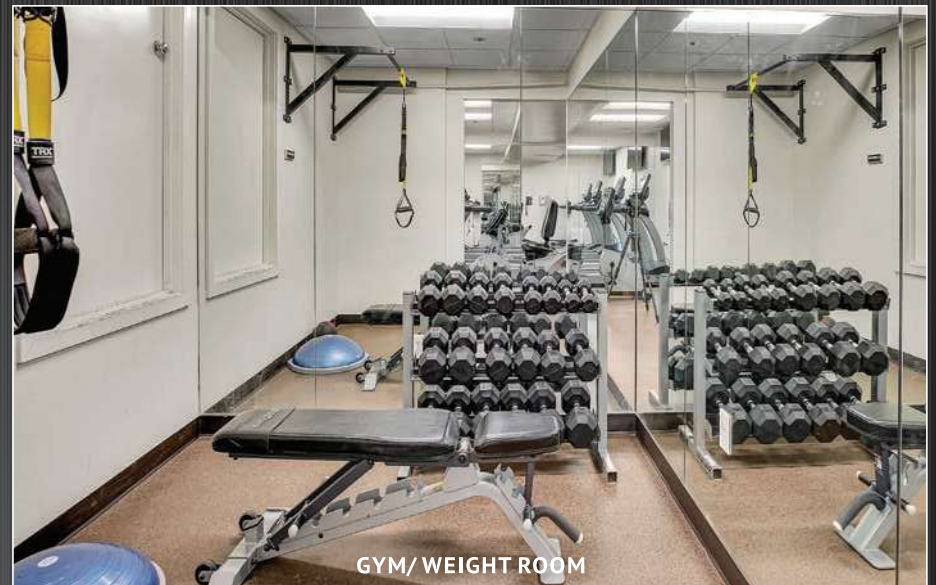
GYM/ WEIGHT ROOM