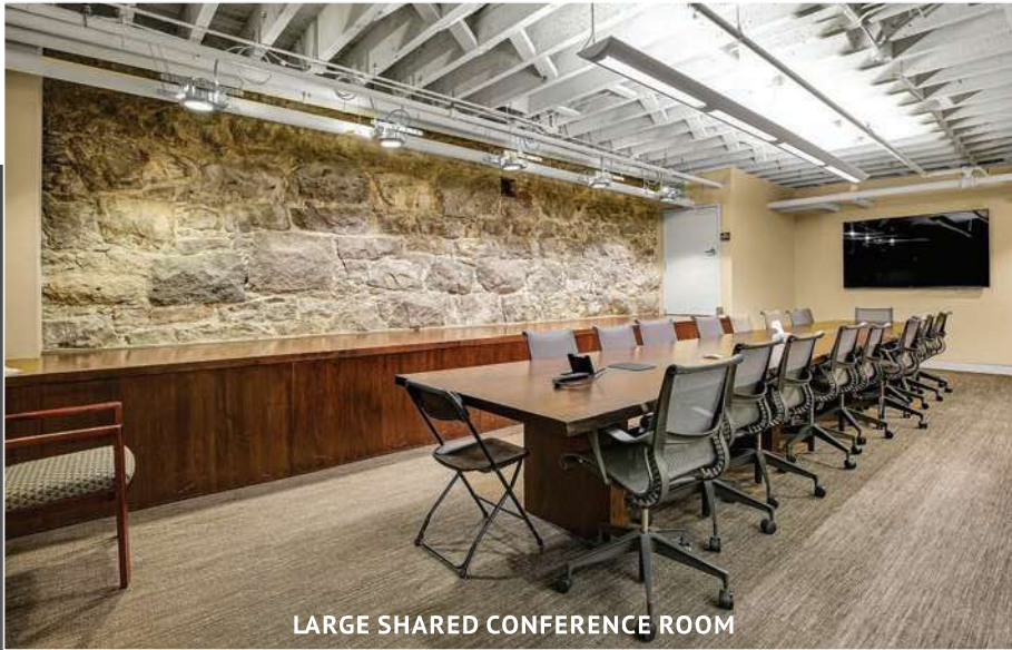
LARGE SHARED CONFERENCE ROOM