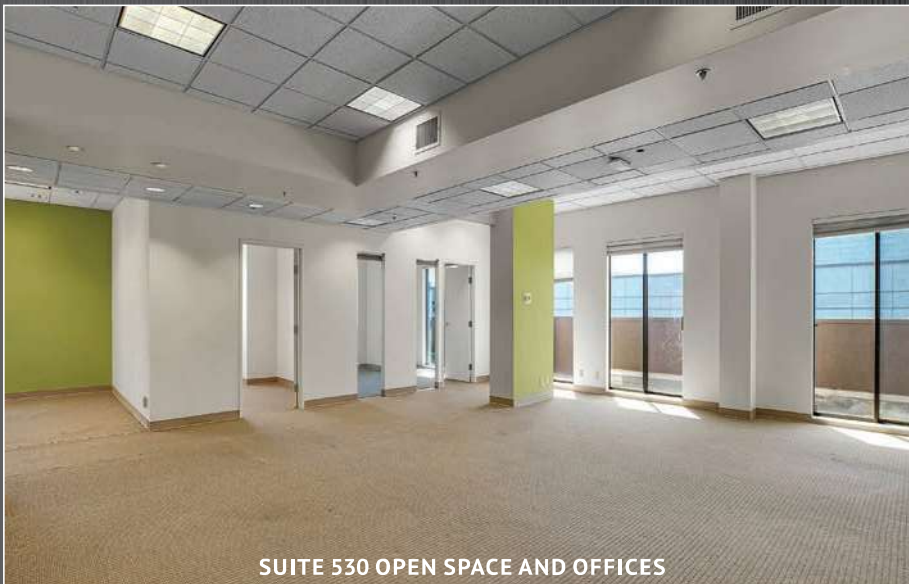
SUITE 530 OPEN SPACE AND OFFICES