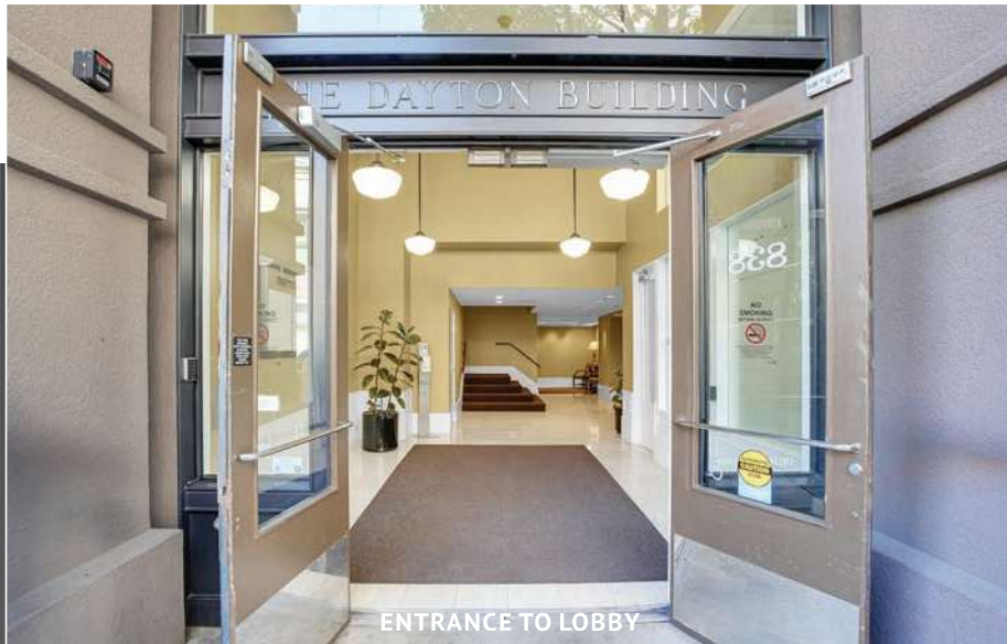
ENTRANCE TO LOBBY