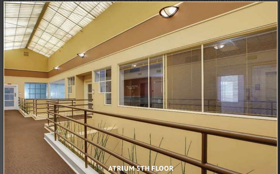
ATRIUM 5TH FLOOR