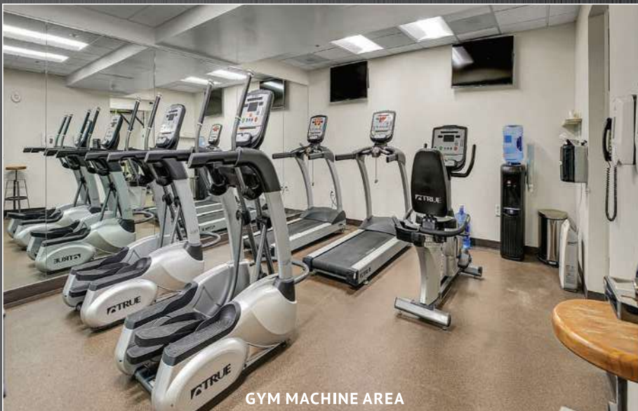
GYM MACHINE AREA