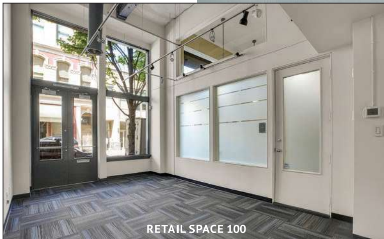
RETAIL SPACE 100