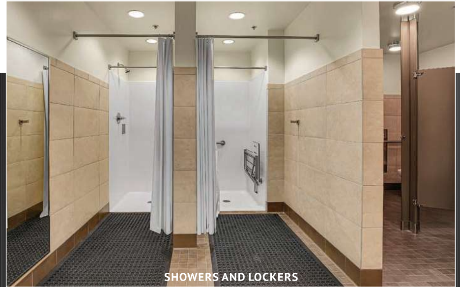
SHOWERS AND LOCKERS