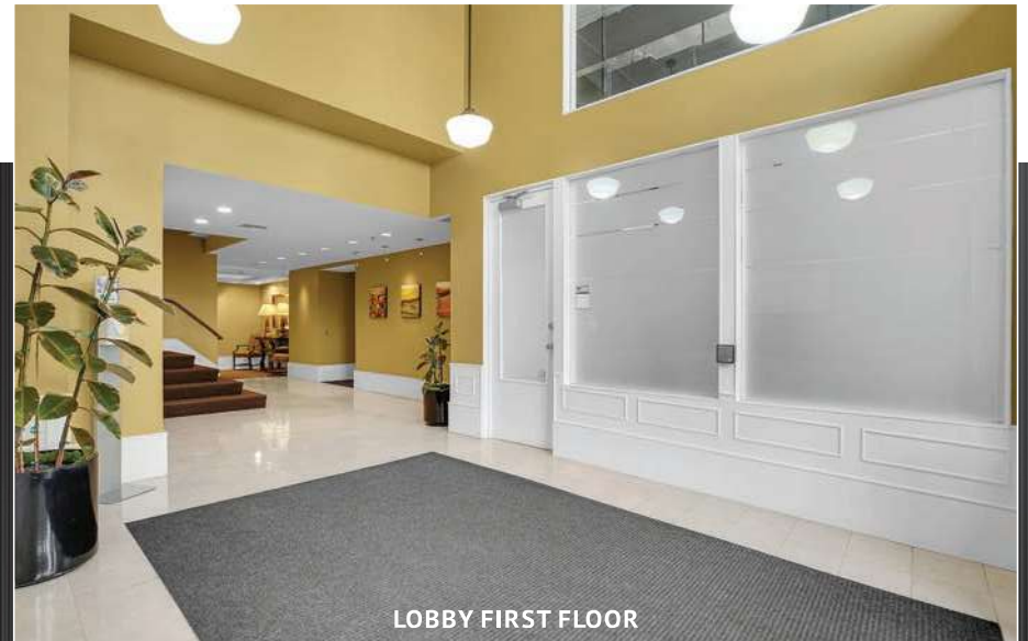
LOBBY FIRST FLOOR