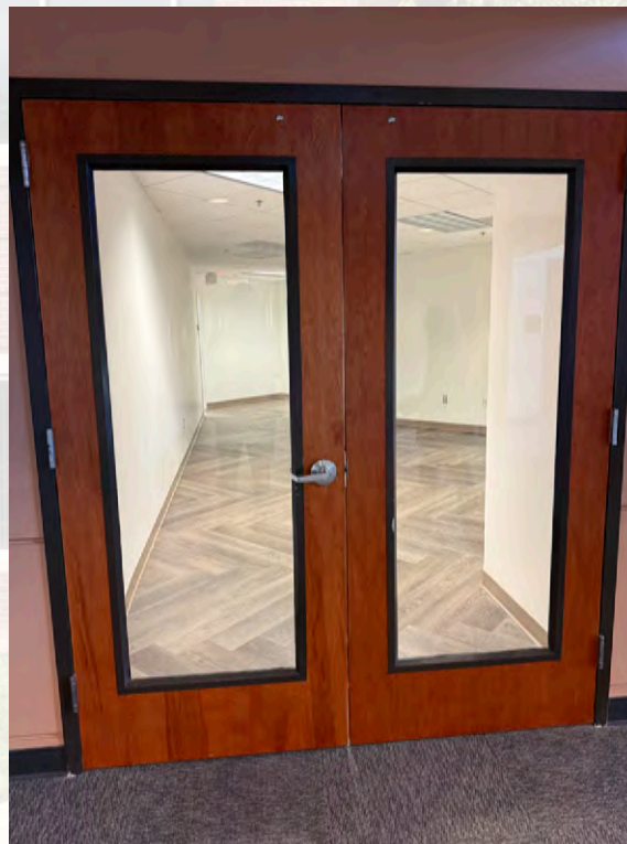
Lobby Suite Entry