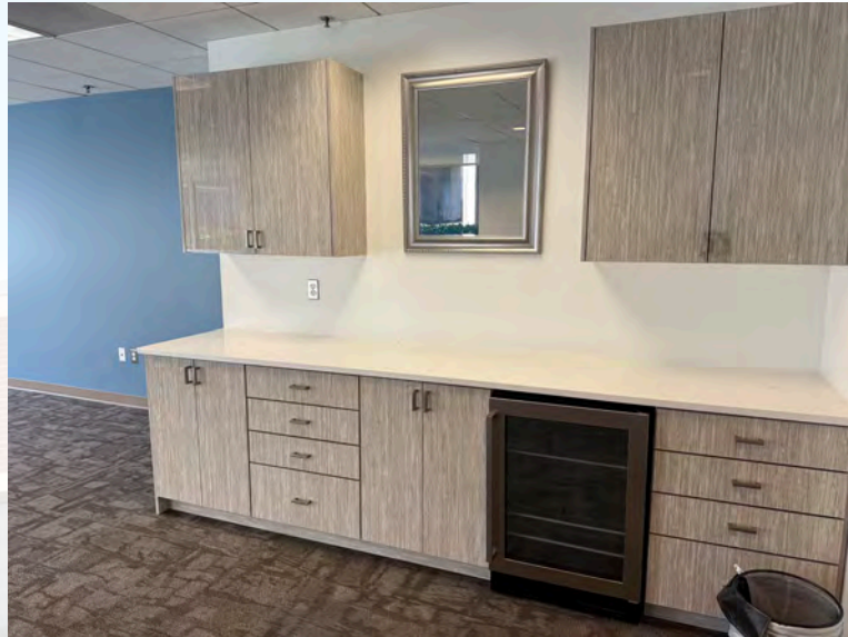
Conference Room Amenity Area