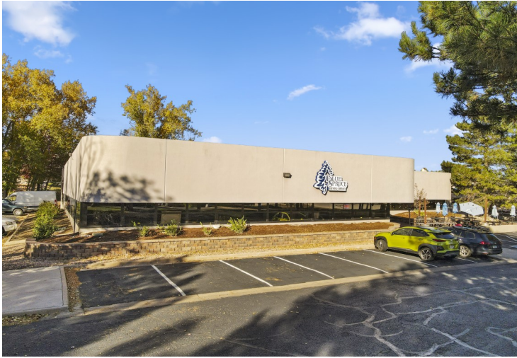
Ken Caryl Business Park

Location: 10577 W Centennial Rd Littleton , CO 80127 Building Size: 30,656 sq ft Available: 14,357 sq ft (West Wing) Lot Size: 2.05 Acres Year: 1981 Lease Rate: $8.00 -$10.00 psf NNN CAM Fees: $5.85 psf Power: 1,600 AMP/480 Volt Sale Price: $5,250,000.00