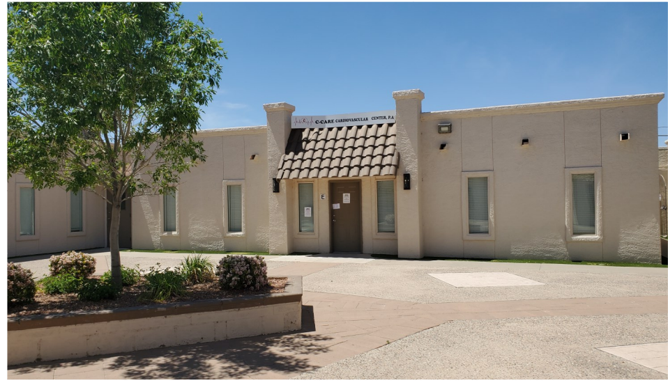
Building E 1445 Bessemer