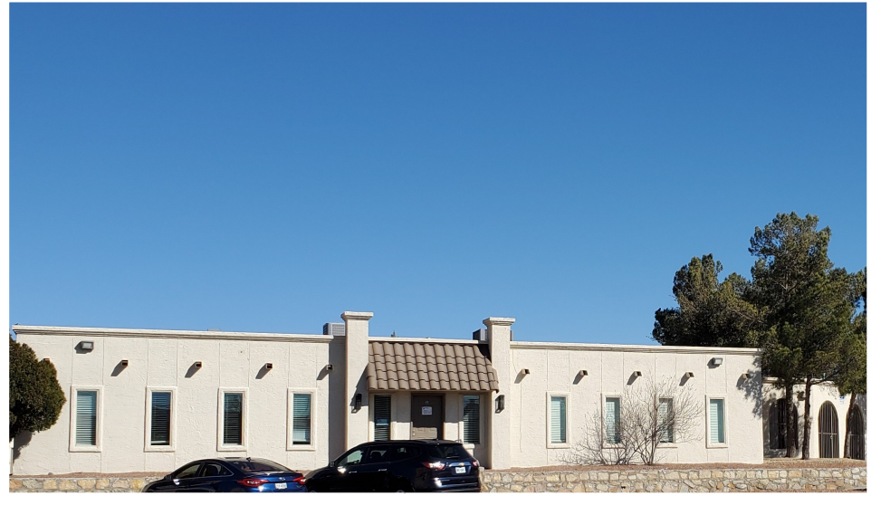
Building A 1445 Bessemer