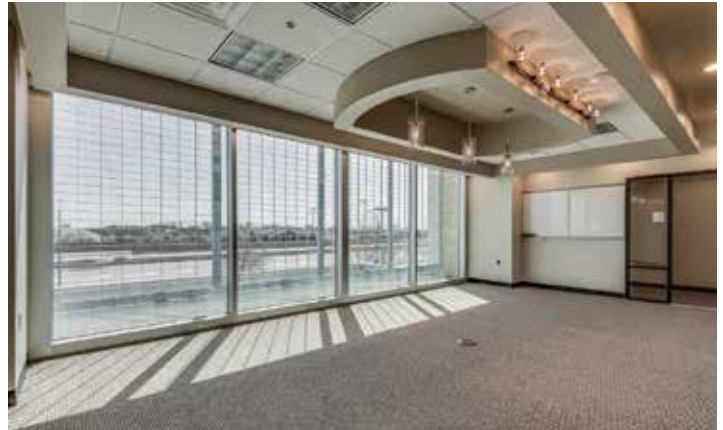
2nd Floor Conference Room