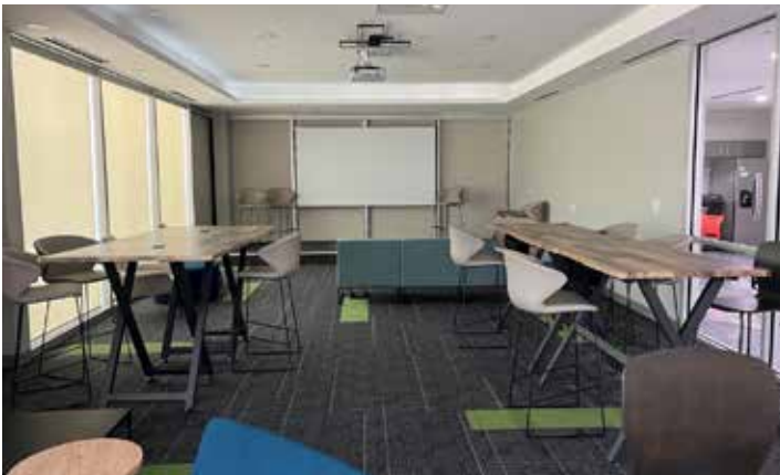
New Tenant Conference Facility