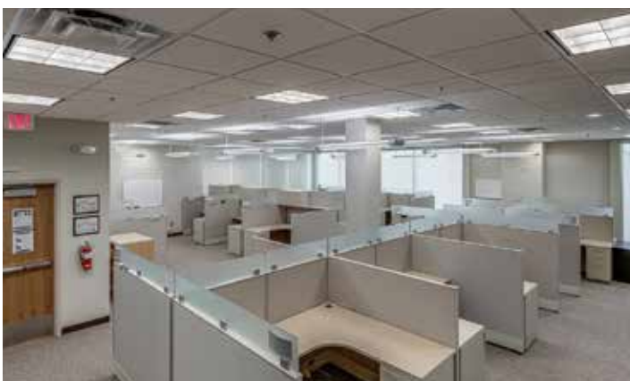
Systems Furniture Available with Natural Light