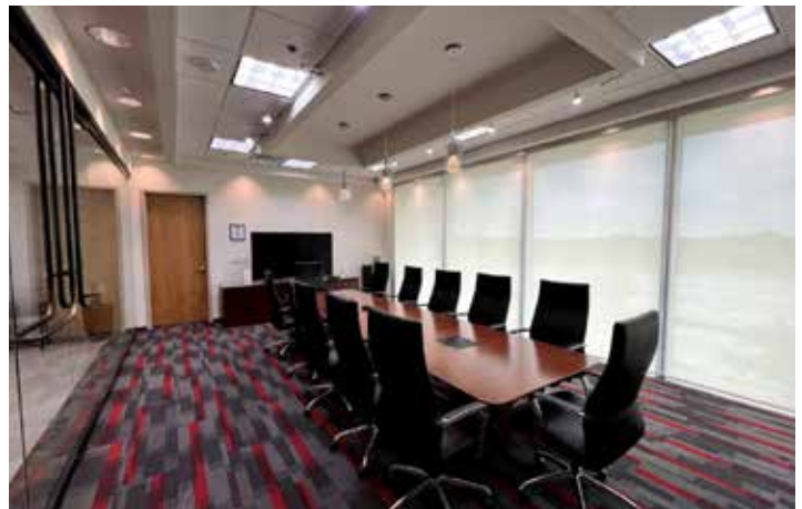
Newly Renovated 3rd Floor Conference Room