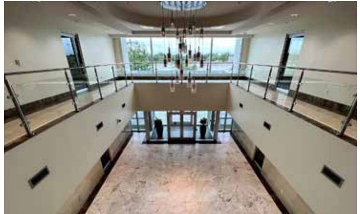
Newly Renovated Atrium and Lobby