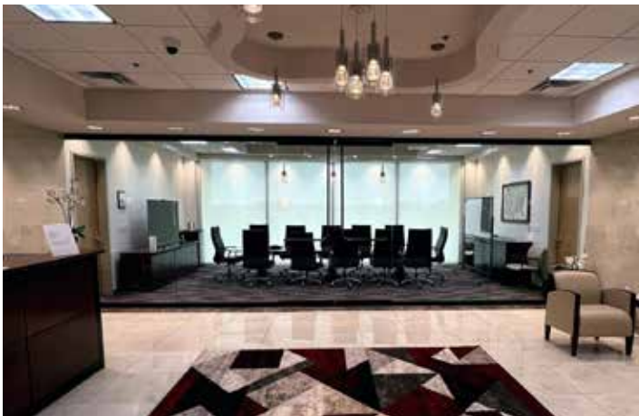
Newly Renovated 3rd Floor Conference Room