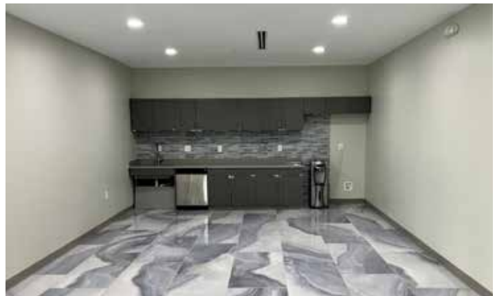
New Tenant Lounge