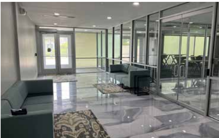
New North Entrance, Lobby, Lounge, & Conference Facility