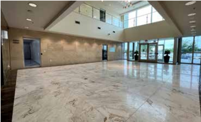
Newly Renovated Atrium and Lobby