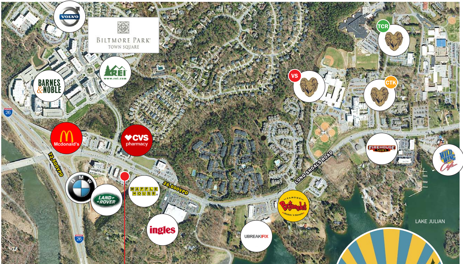
MAP CREDIT: NOAA