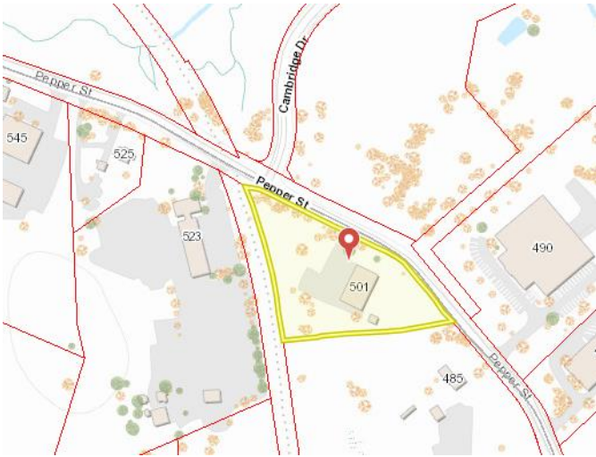
Basic parcel Map