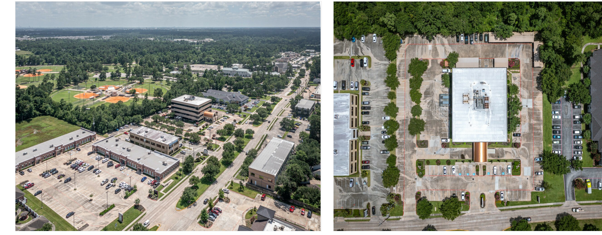
Adjacent to Collins Park