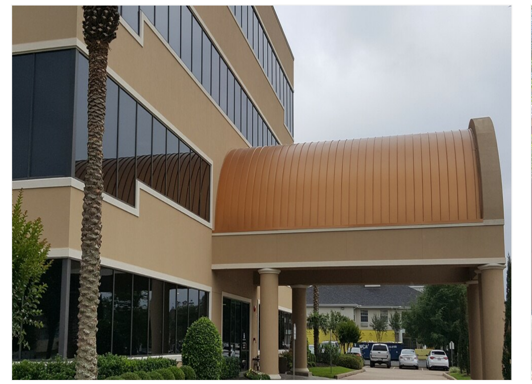
Unique & Distinctive Entry