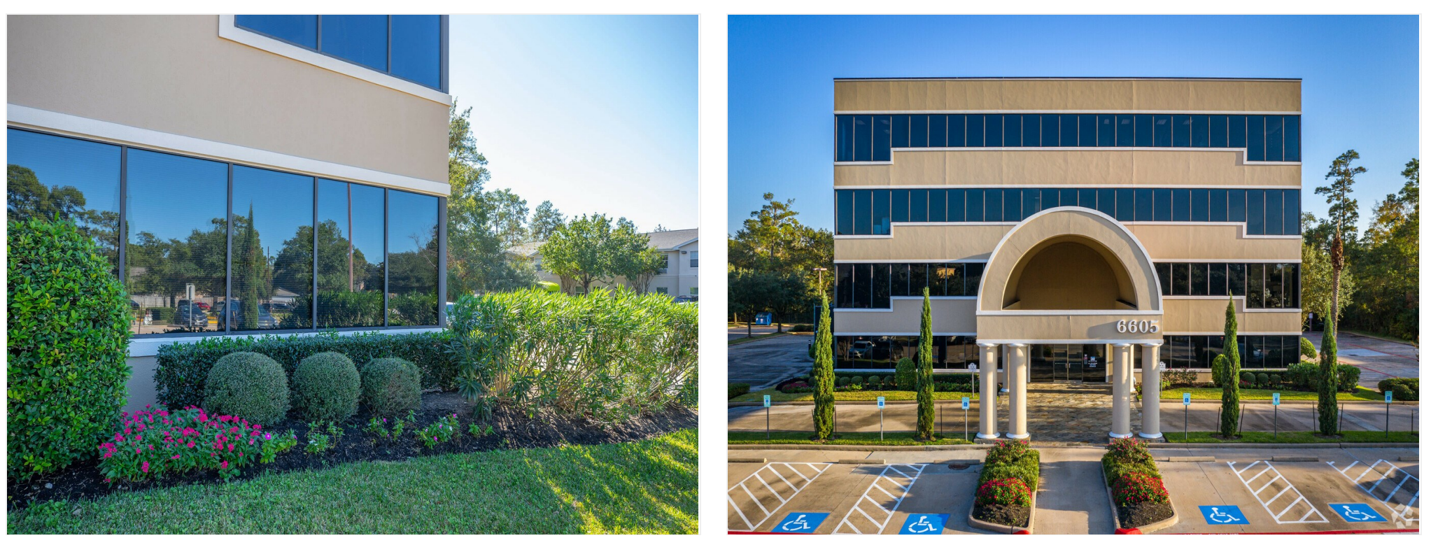
Great exterior and landscaping