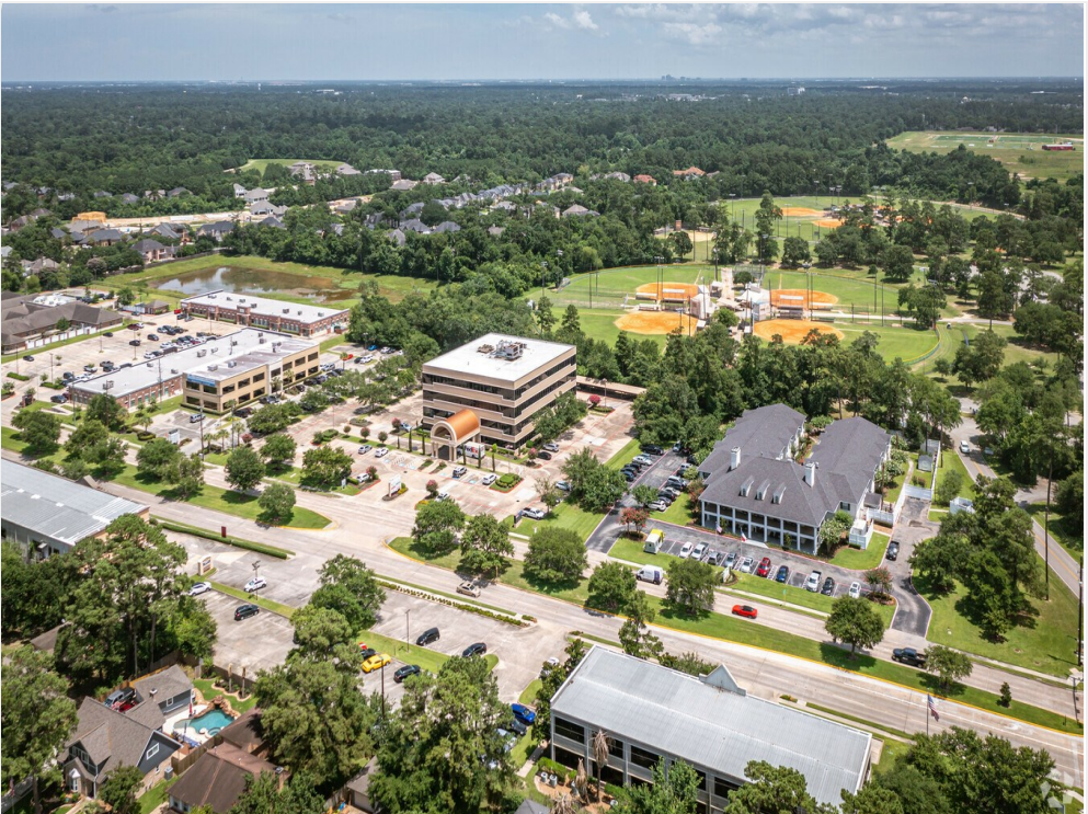
Nestled in an Amenity-Rich North Houston Suburb