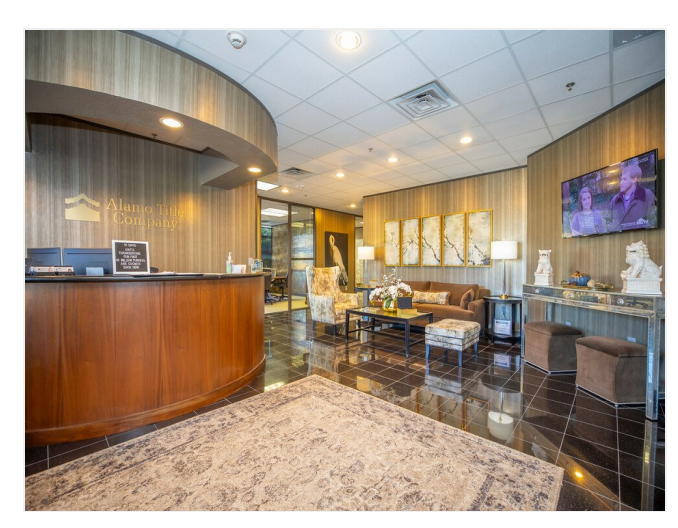
Stylishly Decorated Lobby