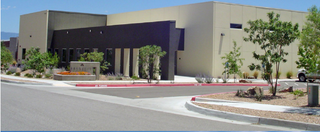
Garden - Office