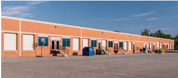
Flex/R&D dock and drive-in loading

Upon completion, Greenleigh will comprise of 18 flex/R&D buildings, totaling more than 763,200 square feet of space. Tenant sizes from 2,520 square feet to 59,400 square feet of space offer businesses straight-forward, economical and high-utility space. These flexible buildings feature dock and drive-in loading with wide truck courts.