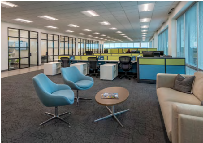
Multi-story class 'A' office build-out