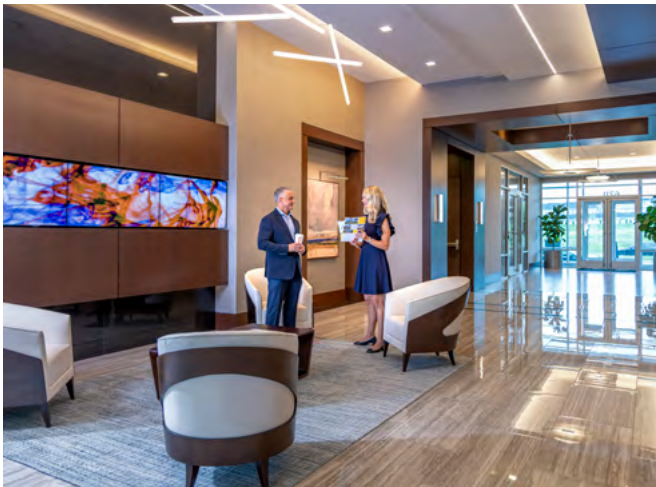
6211 Greenleigh Avenue, class 'A' office lobby