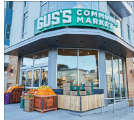
GUS'S COMMUNITY MARKET