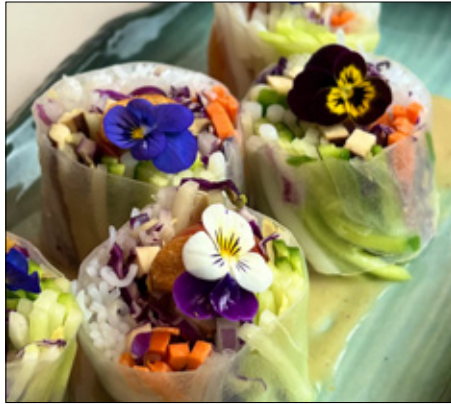
KAYAH BY BURMA LOVE