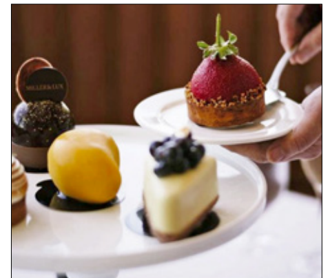
MILLER & LUX