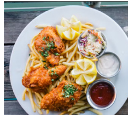
MISSION ROCK RESORT