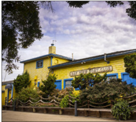
BAYVIEW BOAT CLUB