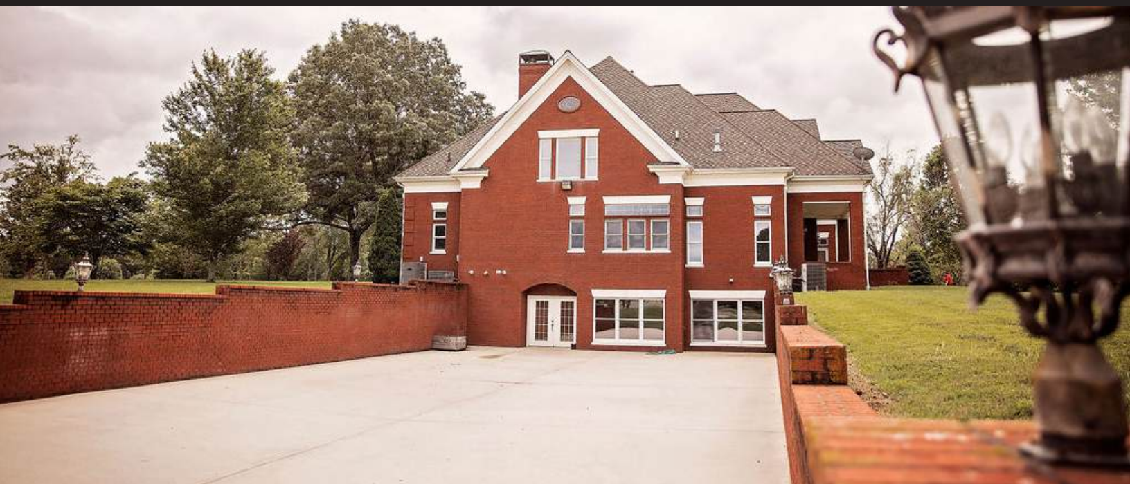
North side of home with parking area and separate entrance to the basement level