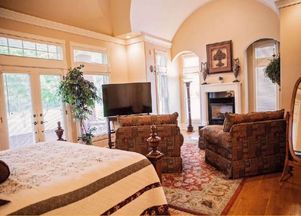
Main Floor – Master Suite