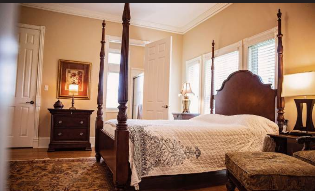
Main Floor Guest Bedroom