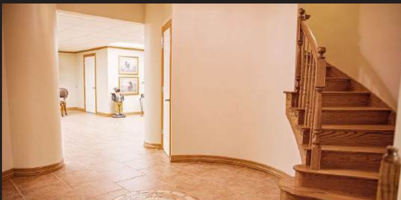
Basement Staircase to Main Floor

The basement has its own entrance and parking area, full kitchen, two bedrooms, one full bath, one half bath with separate large, handicap accessible walk-in shower. The basement also features a cedar closet, large flex room/space, office area/storage rooms and utility/mechanical room.