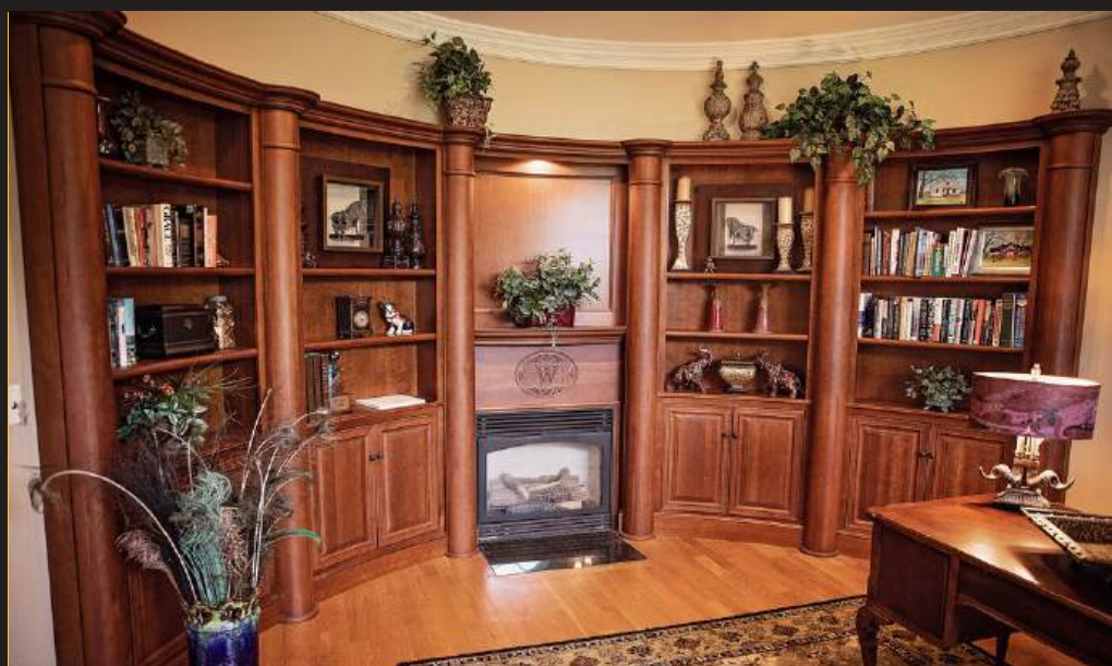
Oval Office / Study