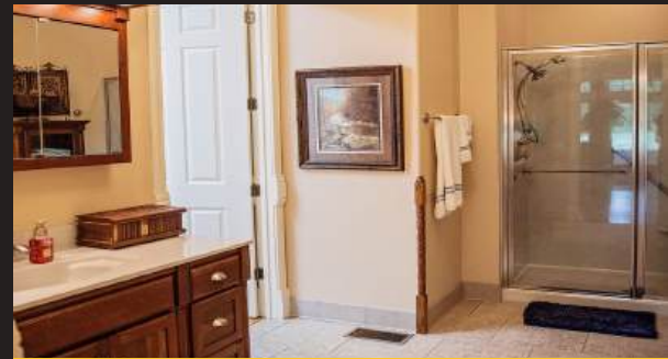
Master Suite – His Bathroom