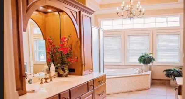
Master Suite – Her Bathroom