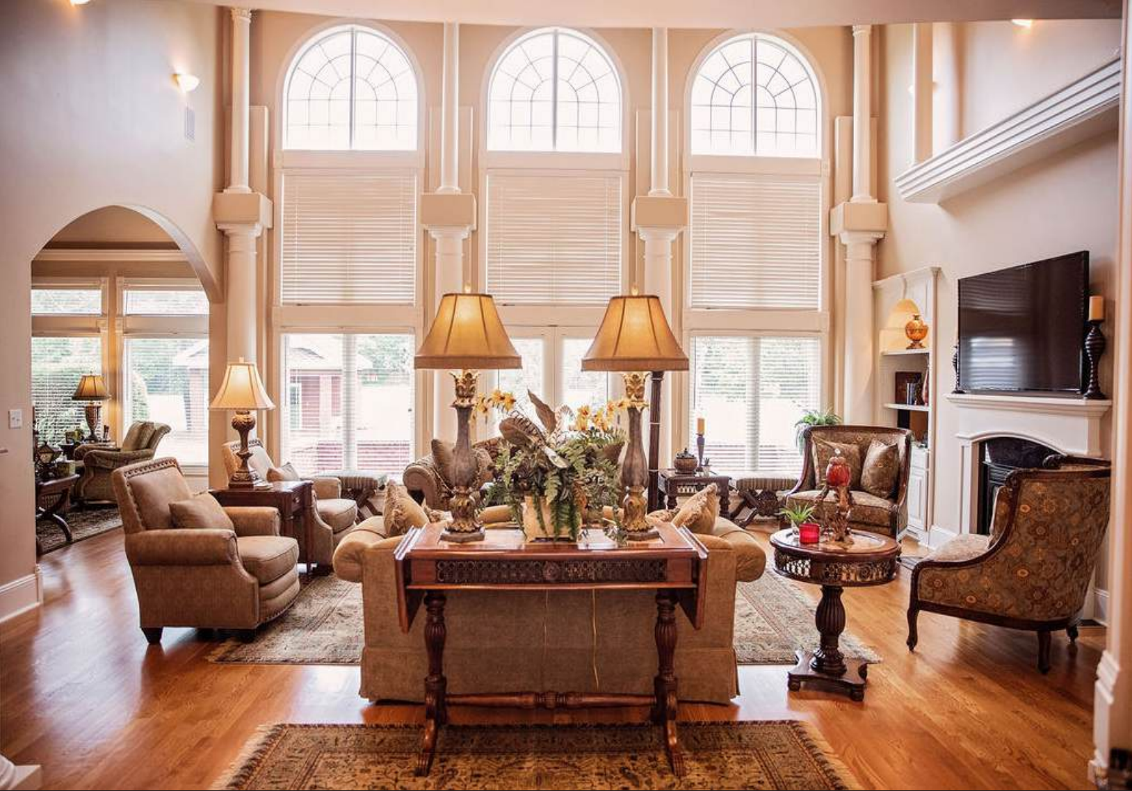
The light-filled formal living room features custom built-in bookcases, gas log fireplace, second floor balcony and cathedral height ceilings with custom molding.