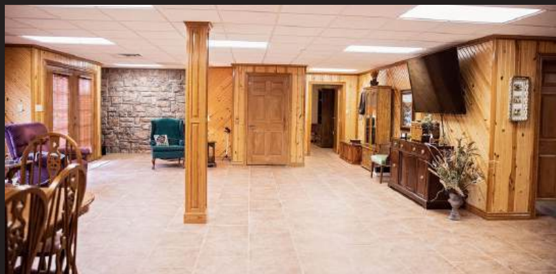
Basement Living Area & Elevator Access