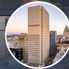
Colliers | Pittsburgh 525 William Penn Pl. Suite 3510 Pittsburgh, PA 15219 P: 412-321-4200