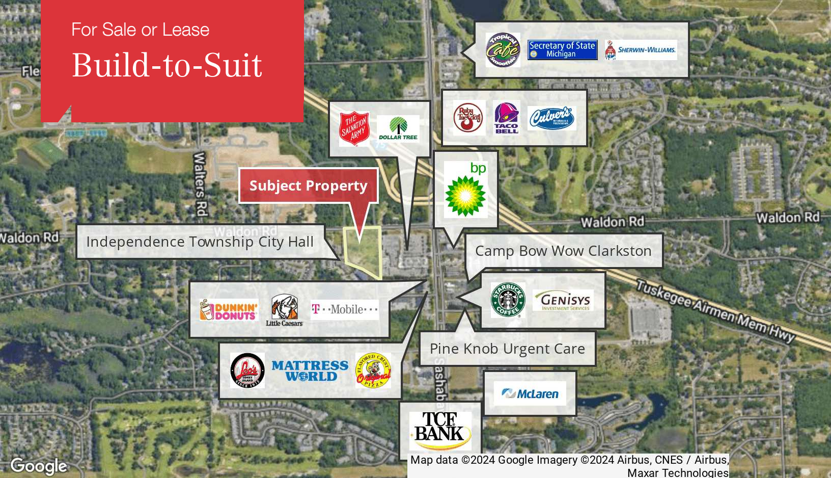
Map data ©2024 Google Imagery ©2024 Airbus, CNES / Airbus, Maxar Technologies