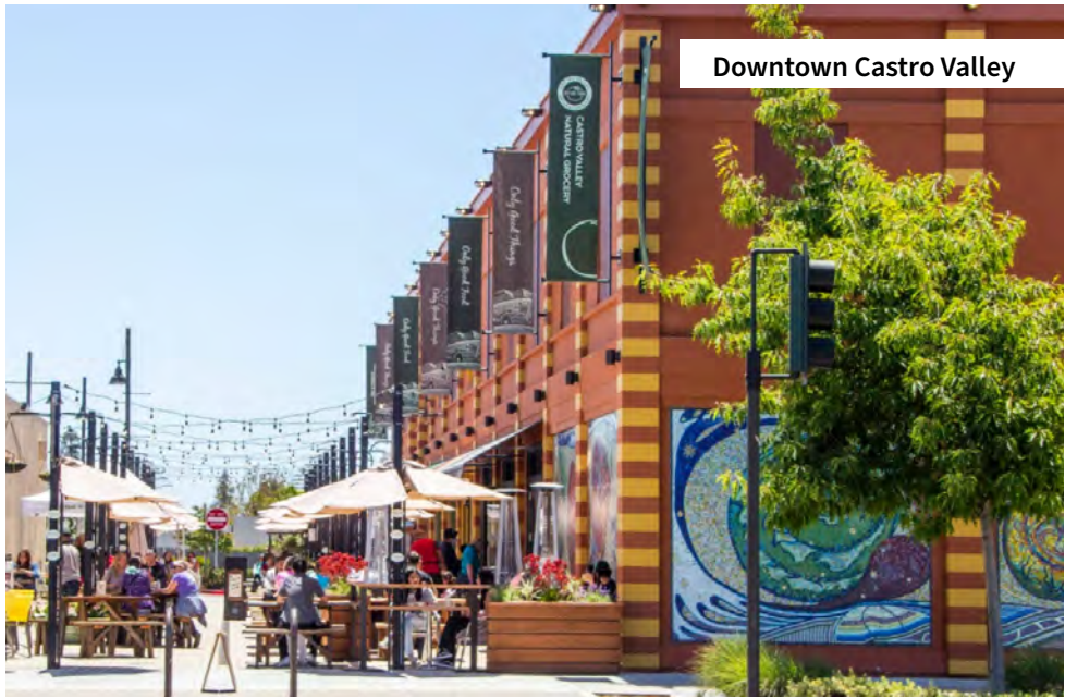
Downtown Castro Valley