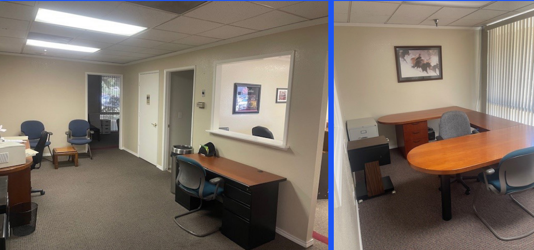
Interior photos of Suite 100