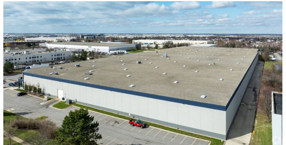
66,452 SF AVAILABLE FOR LEASE | 3-7 TIMBER CT, BOLINGBROOK, IL