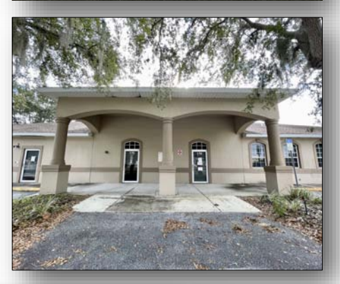
For more information please contact: Grizzard Commercial Real Estate Group