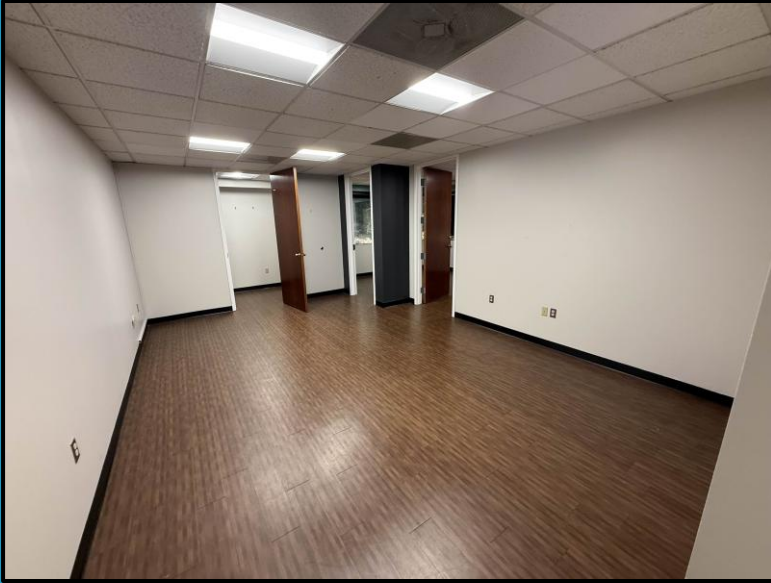
Suite 110: 836 SF