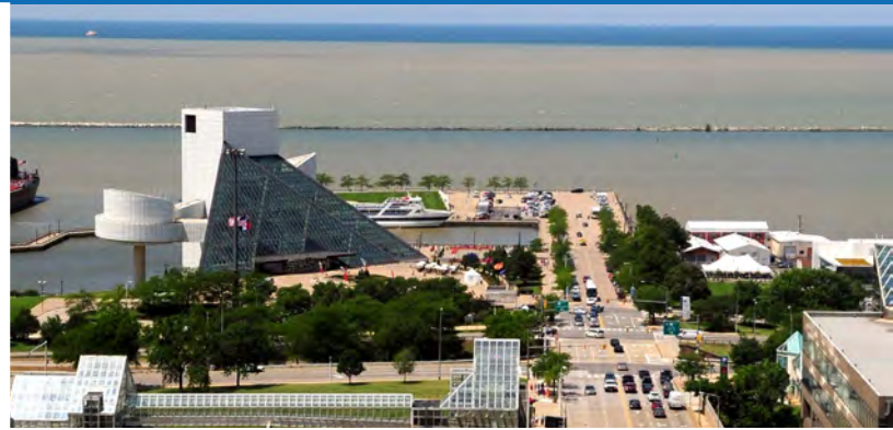
Excellent Views of Downtown Cleveland and Lake Erie