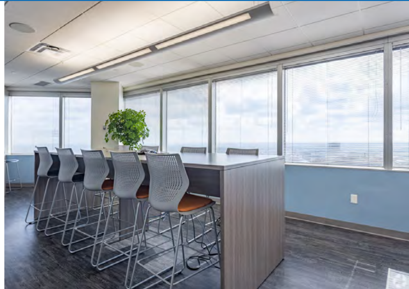
The Building Features Attractive Suite Layouts