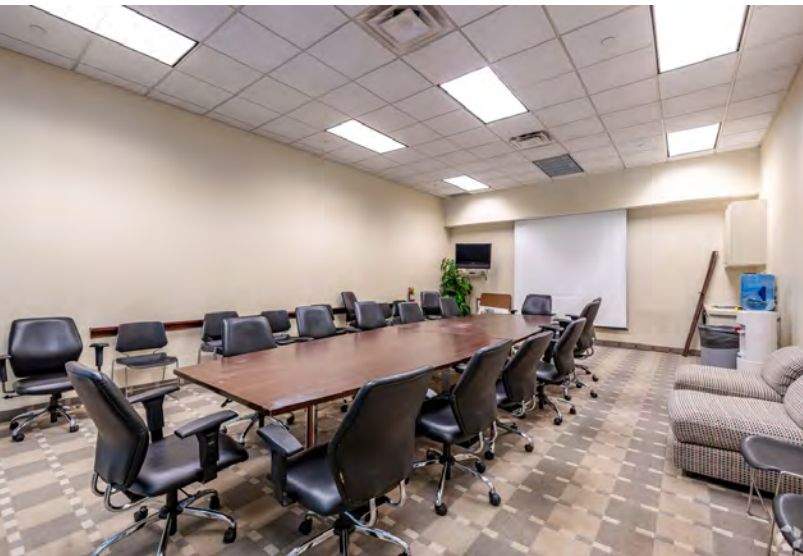
Building Conference Room