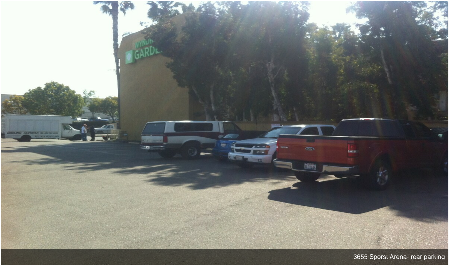
3655 Sporst Arena- rear parking