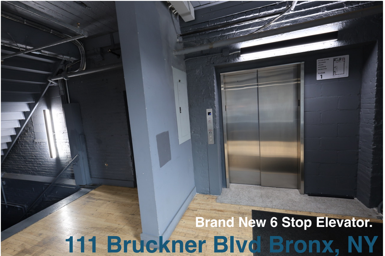
Brand New 6 Stop Elevator. 111 Bruckner Blvd Bronx, NY