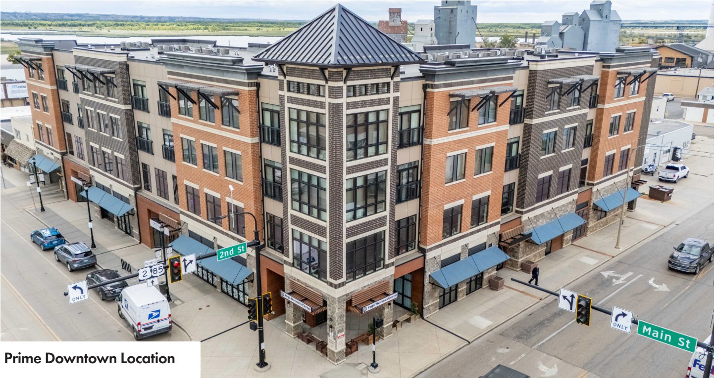
Prime Downtown Location