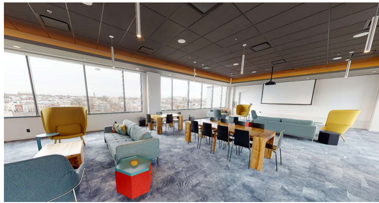
PENTHOUSE TENANT LOUNGE.

garage style doors to connect indoor lounge to outdoor terrace space. floor games & Wi-Fi . spacious indoor & outdoor areas perfect for hosting team or client events . tv, projector, couches, & chairs. easily converted from lounge to conference / training upon request.