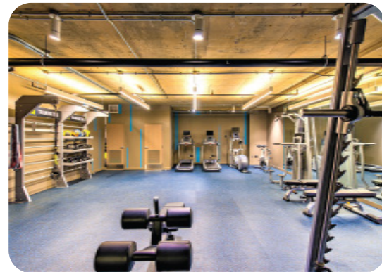
BRAND NEW FITNESS CENTER & BIKE STORAGE ROOM.