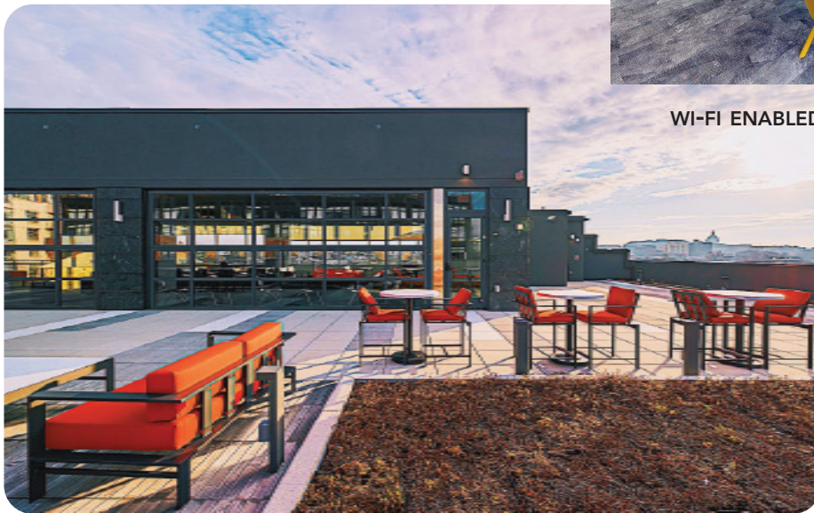
ROOF TERRACE WITH CAPITOL VIEWS.