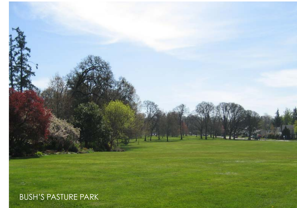
BUSH'S PASTURE PARK