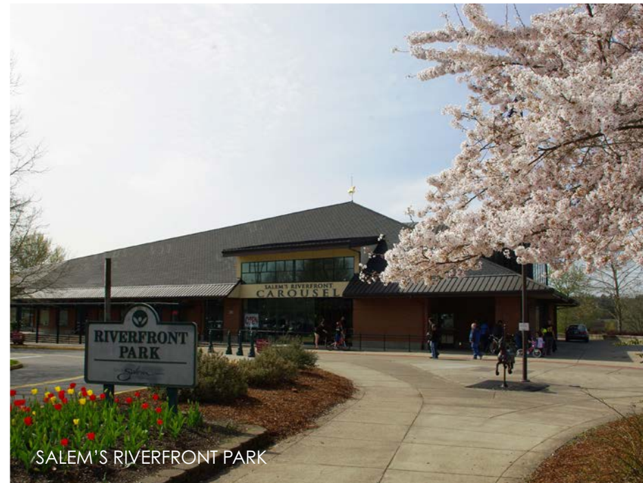
SALEM'S RIVERFRONT PARK

Retail and dining are anchored by centers such as the Willamette Town Center and Keizer Station, which feature national retailers, restaurants, and entertainment venues. Downtown Salem continues to thrive with a mix of independent shops, cafés, breweries, and farm-to-table restaurants that reflect the area's agricultural richness.