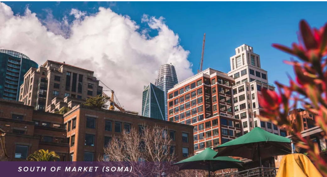
SOUTH OF MARKET (SOMA)

±2,000 SF. CREATIVE SPACE IN SOUTH OF MARKET (SOMA)