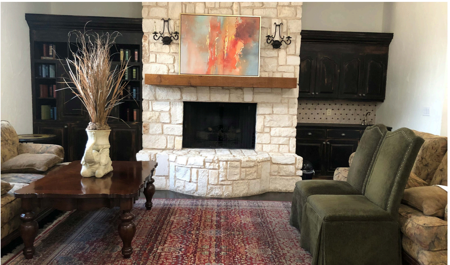
WAITING ROOM 2