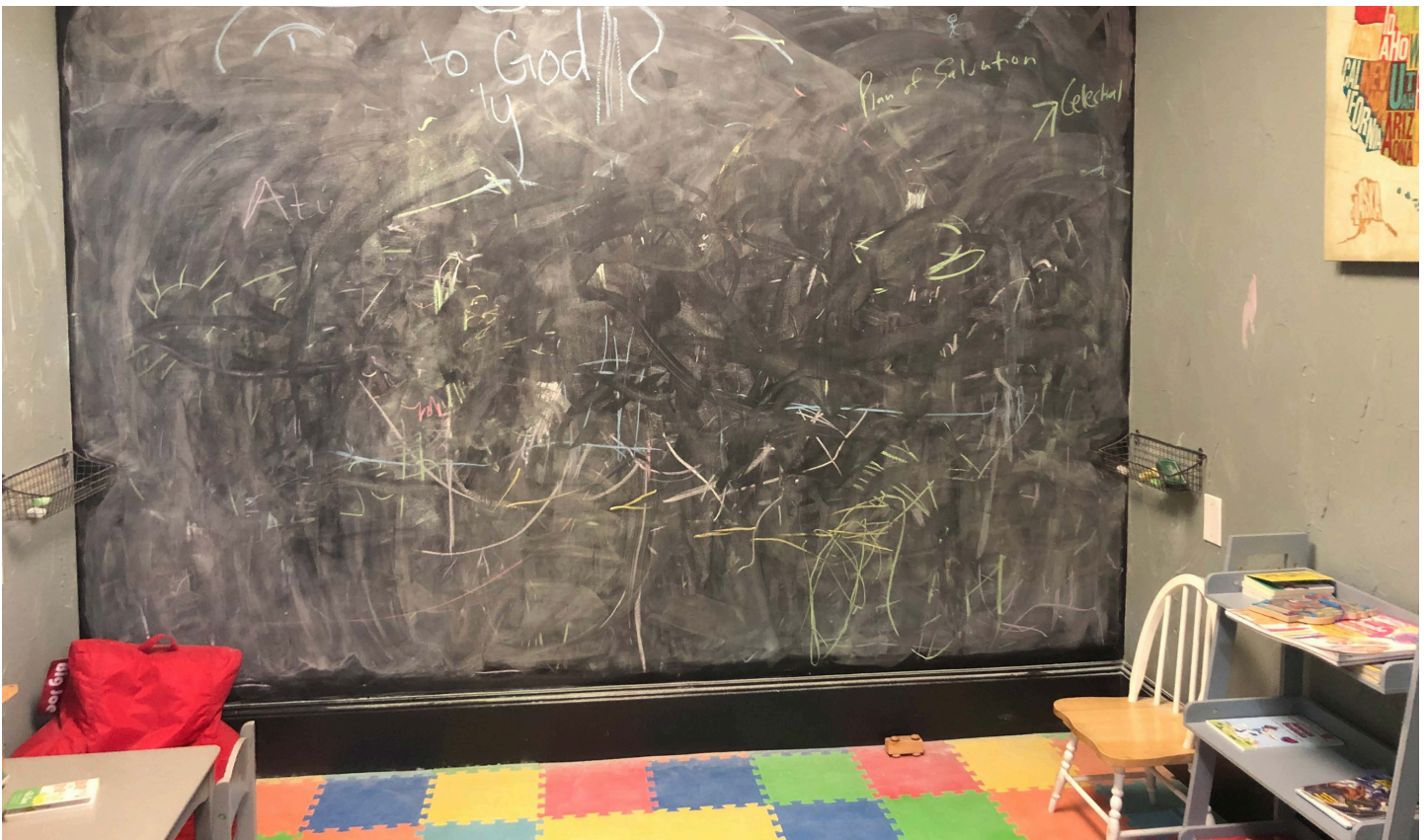
CHILDREN'S WAITING AREA