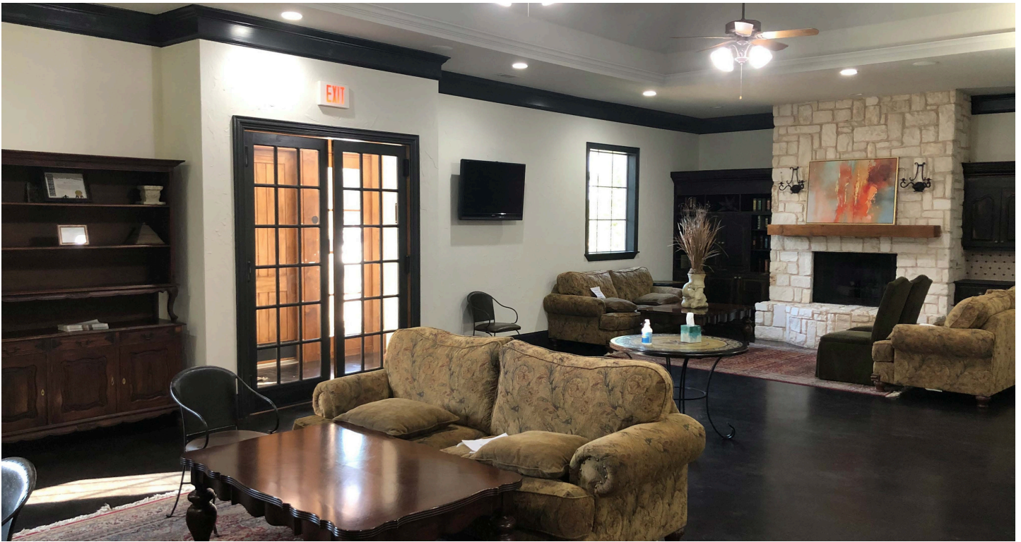
WAITING ROOM 1