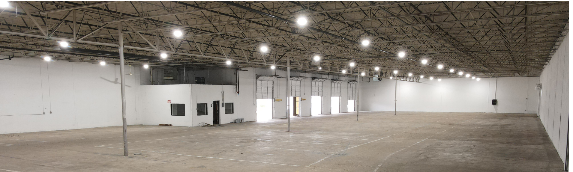
Primary Warehouse Area With Spec Office Pod