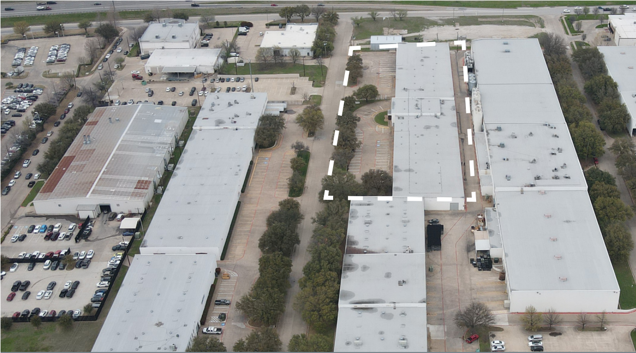
Frontage on Barnett Road