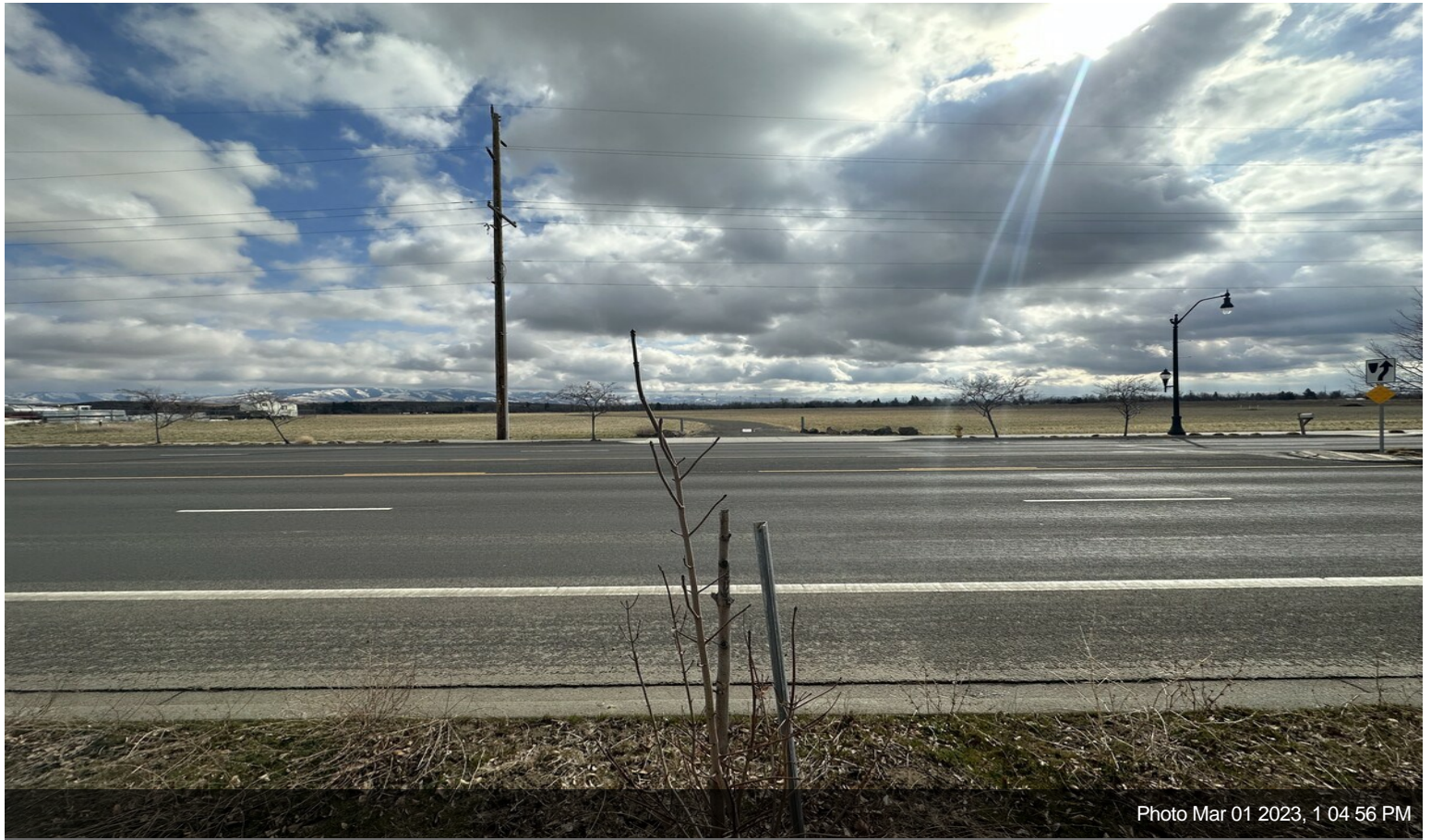
Photo Mar 01 2023, 1 04 56 PM