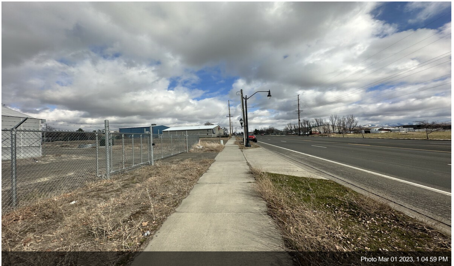
Photo Mar 01 2023, 1 04 59 PM