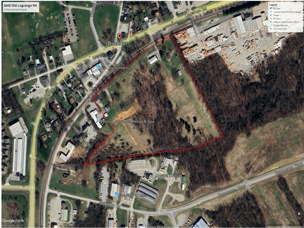
Hey Development 2