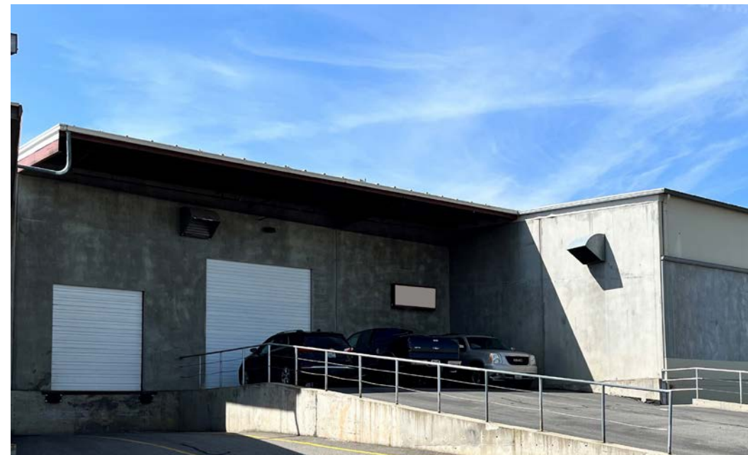
GRADE AND DOCK HIGH LOADING