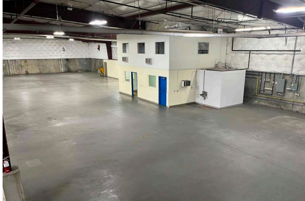
BUILDING 4B | UPPER LEVEL