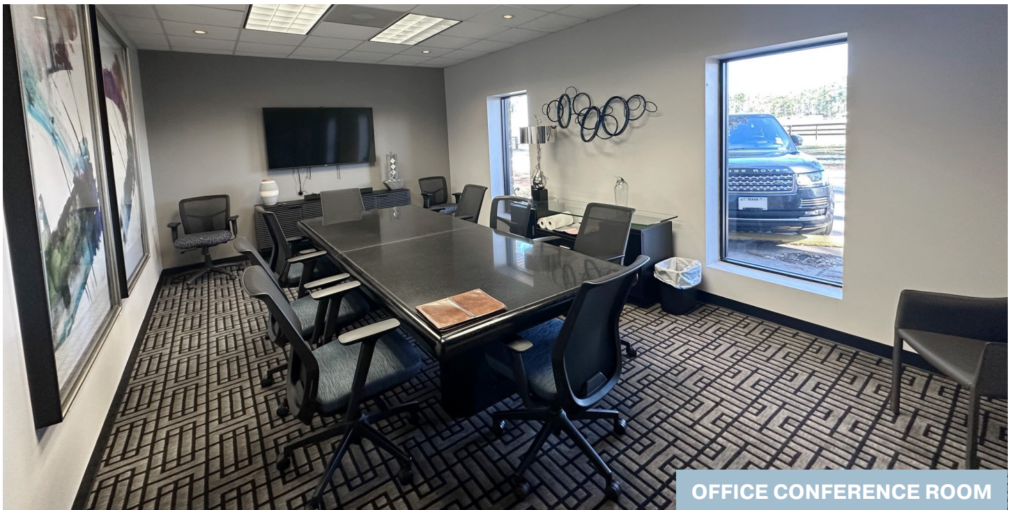
OFFICE CONFERENCE ROOM