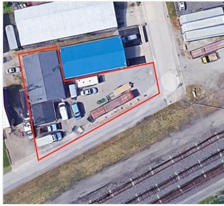
Aerial view of property and surrounding area featuring property parcel outlined