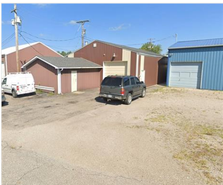
View of front of house featuring an outdoor structure, a garage, and a metal roof