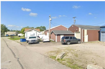
View of front facade featuring a garage and an outbuilding