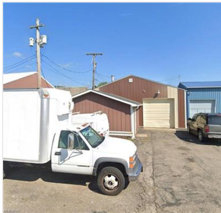
View of front of home with an outdoor structure and a garage