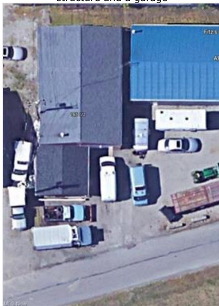
Drone / aerial view

Information is Believed To Be Accurate But Not Guaranteed