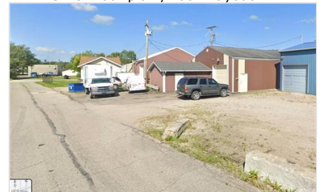
View of front of home featuring an outdoor structure