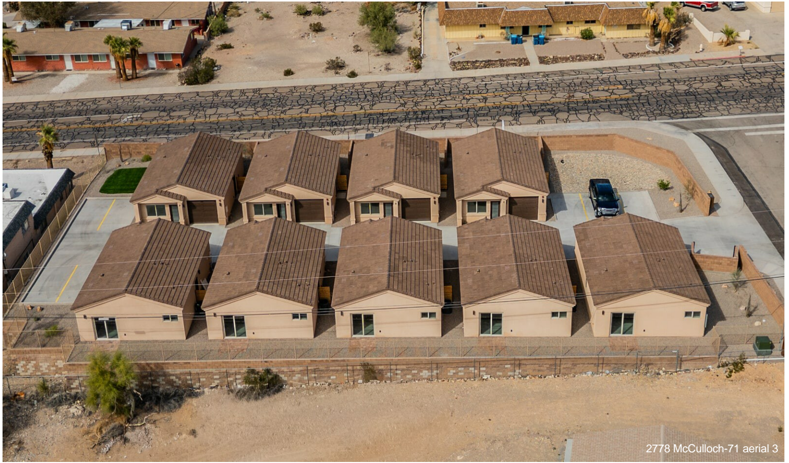
2778 McCulloch-71 aerial 3