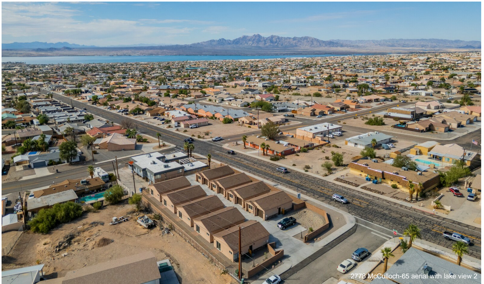
2778 McCulloch-65 aerial with lake view 2