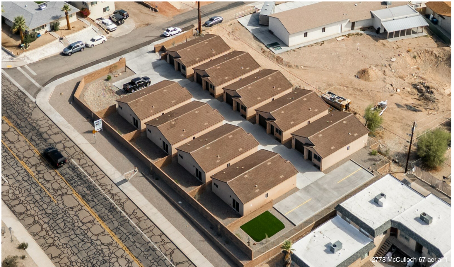
2778 McCulloch-67 aerial 1