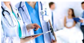
Health & Medical Care