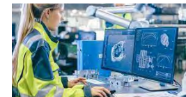
Aerospace / Manufacturing