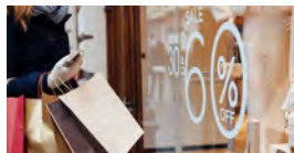
Retail / Food Services