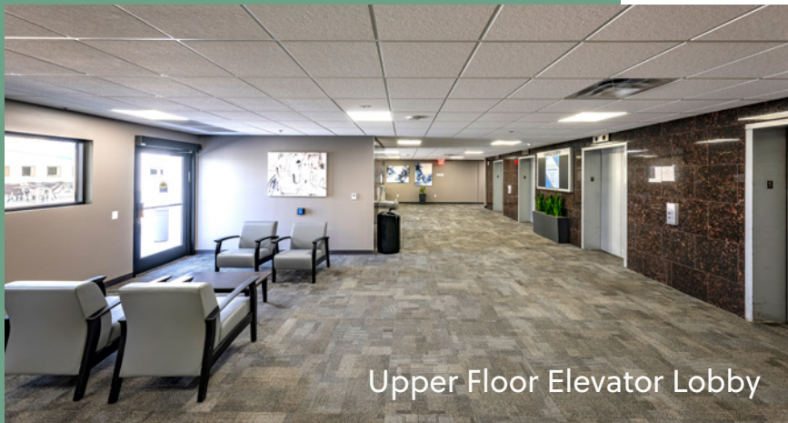
Upper Floor Elevator Lobby