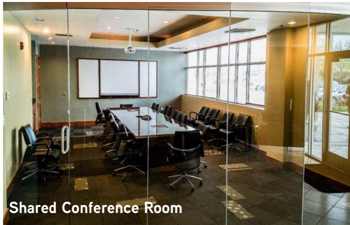
Shared Conference Room