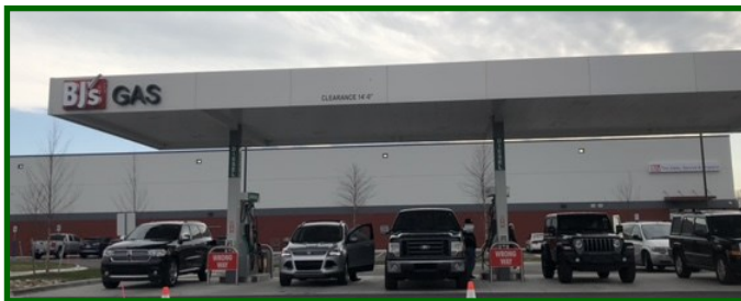
BJ's Gas Station: ALWAYS FULL of Customers