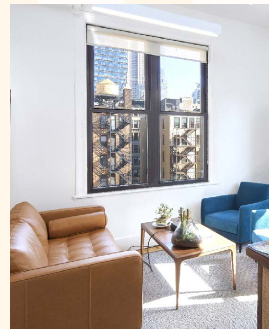
30 WEST 26 TH ST