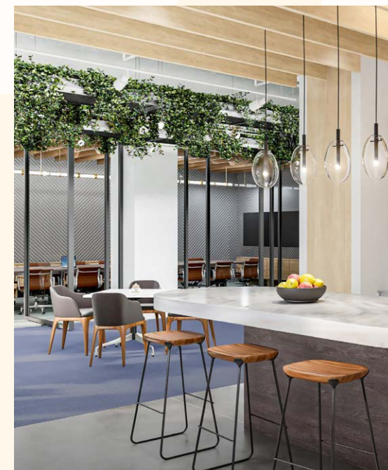
401 PARK AVE S