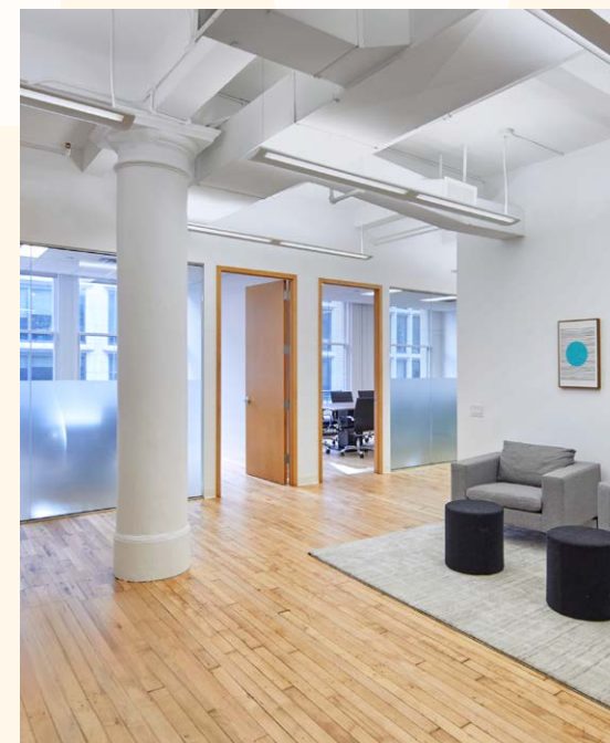
12 WEST 27 TH ST