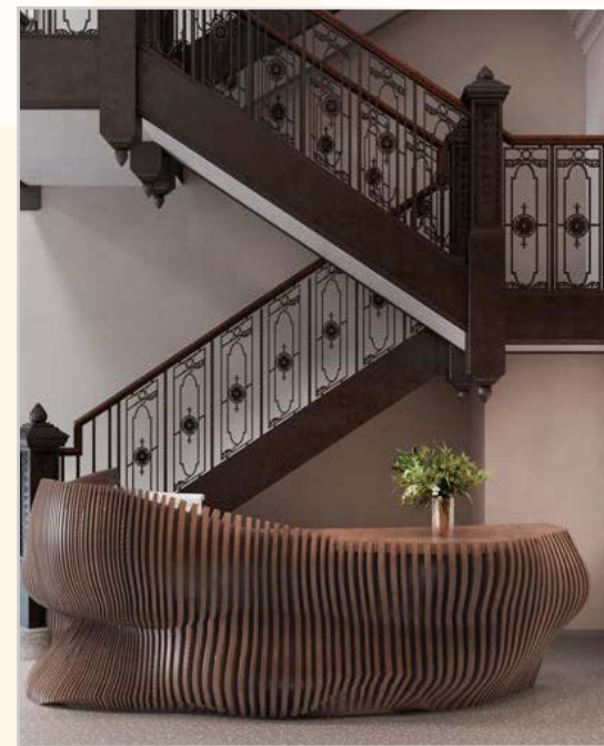
6 EAST 32 ND ST

The Nomad Portfolio is home to a collection of office spaces in one of New York's most exciting neighborhoods. It is where uptown and downtown sensibilities meet and one of Manhattan's most sought-after areas for shopping, dining, work and exploring. Nomad is the place to be from the first meeting of the day to the last whiskey of the night.