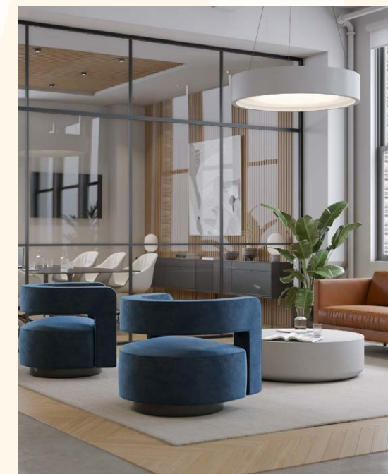
12 WEST 21 ST ST