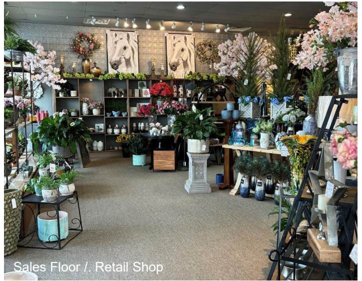
Sales Floor / Retail Shop