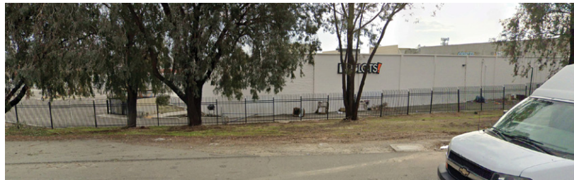
EXISTING VIEW SCALE: NTS