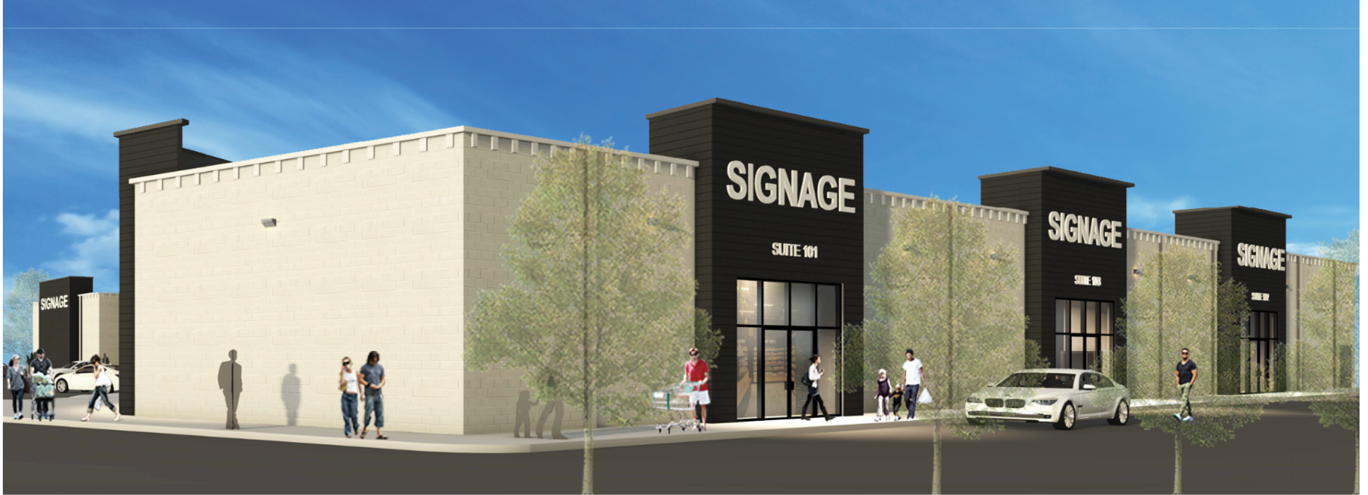
CONCEPTUAL PERSPECTIVE (FACING SOUTH) SCALE: NTS