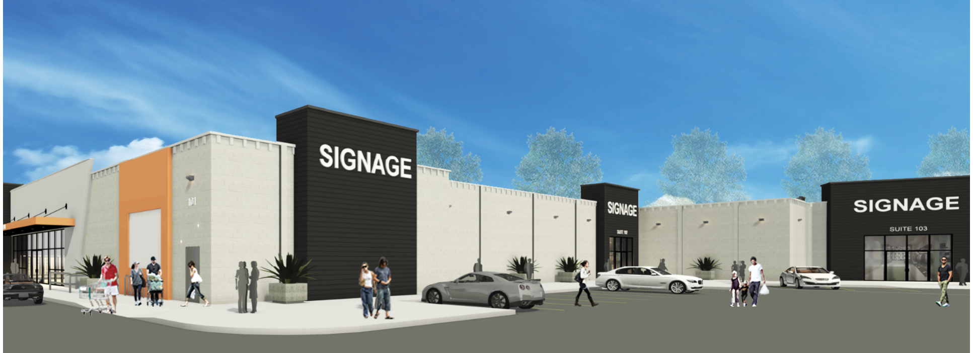
CONCEPTUAL PERSPECTIVE (FACING WEST) SCALE: NTS