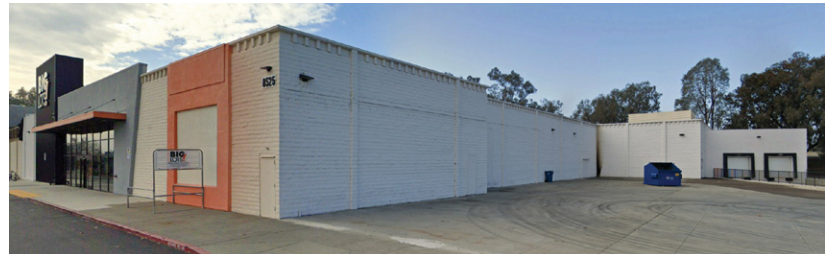
EXISTING VIEW SCALE: NTS