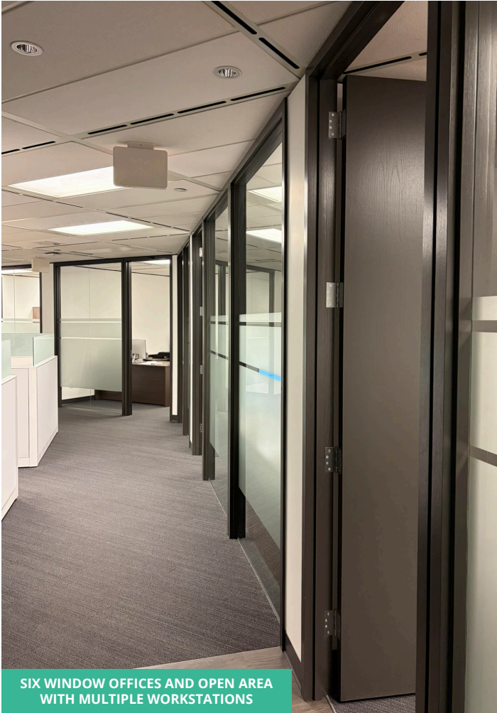
SIX WINDOW OFFICES AND OPEN AREA WITH MULTIPLE WORKSTATIONS