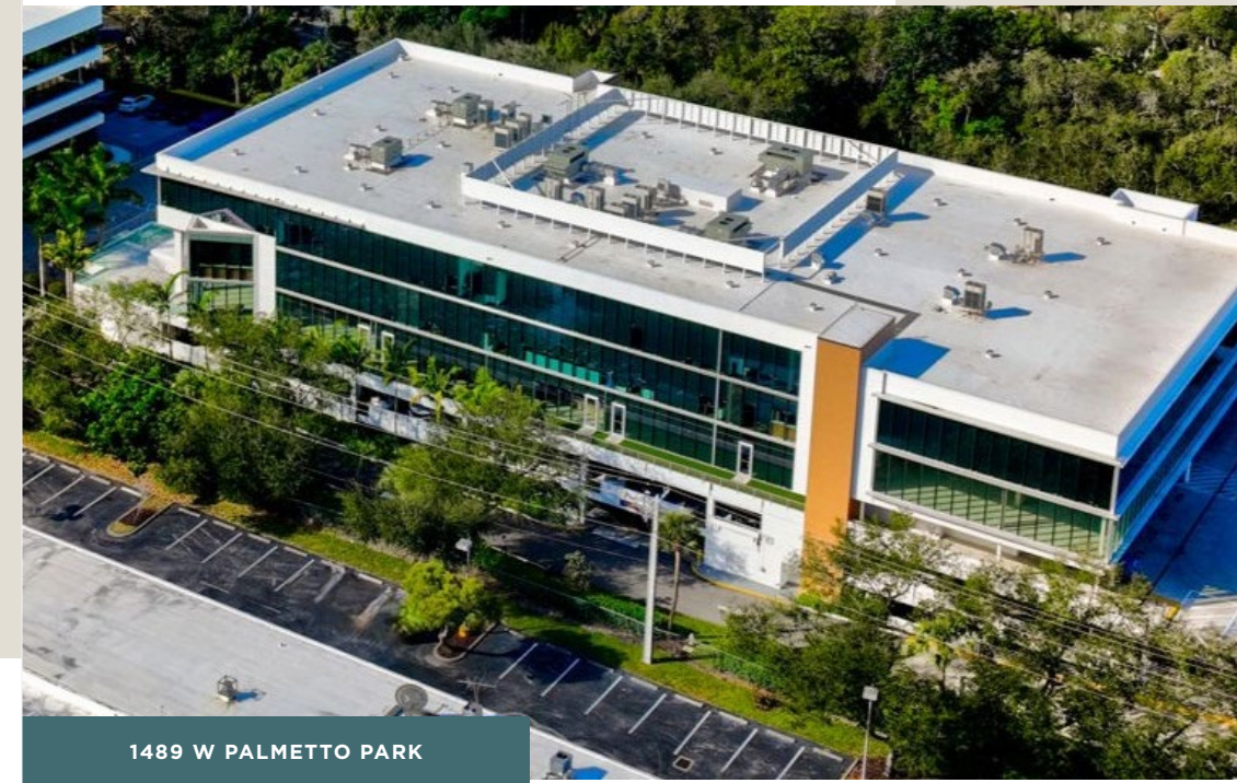
1489 W PALMETTO PARK