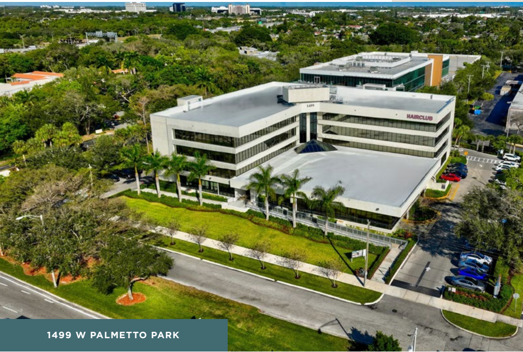
1499 W PALMETTO PARK