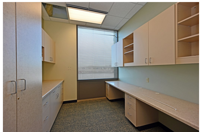
Finished Medical Office Space - Suite 205