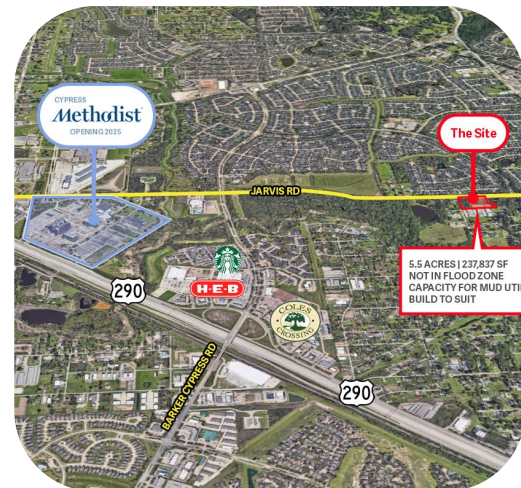
Proposed Office Layout