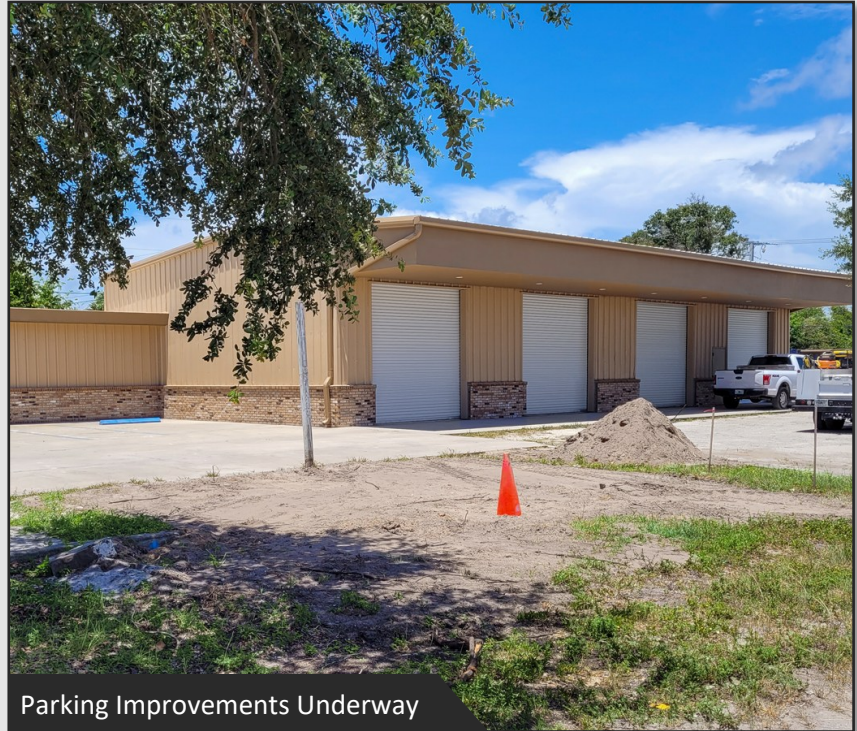
Parking Improvements Underway