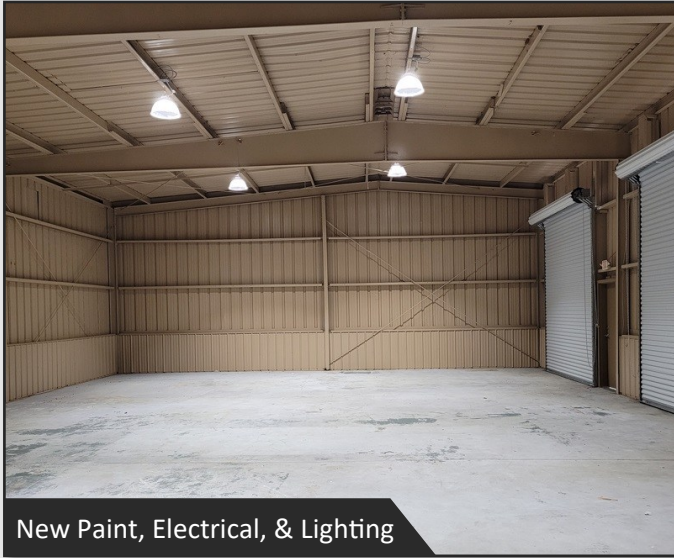
New Paint, Electrical, & Lighting