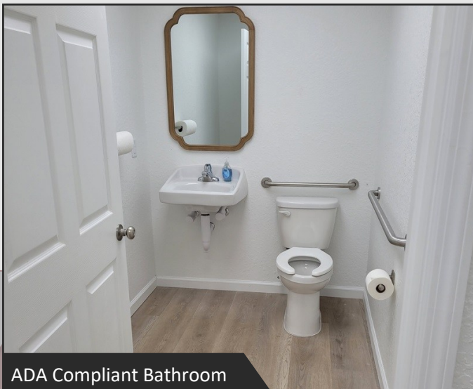
ADA Compliant Bathroom