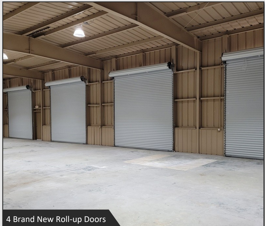
4 Brand New Roll-up Doors