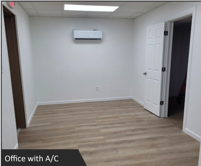
Office with A/C