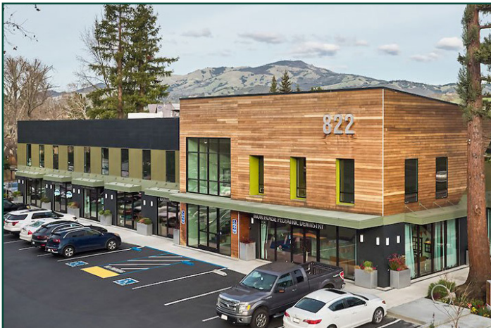
822 Hartz Way Danville, CA