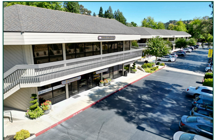
1800-1896 Tice Valley Boulevard Walnut Creek, CA