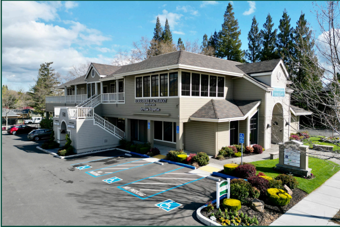
588 San Ramon Valley Blvd Danville, CA