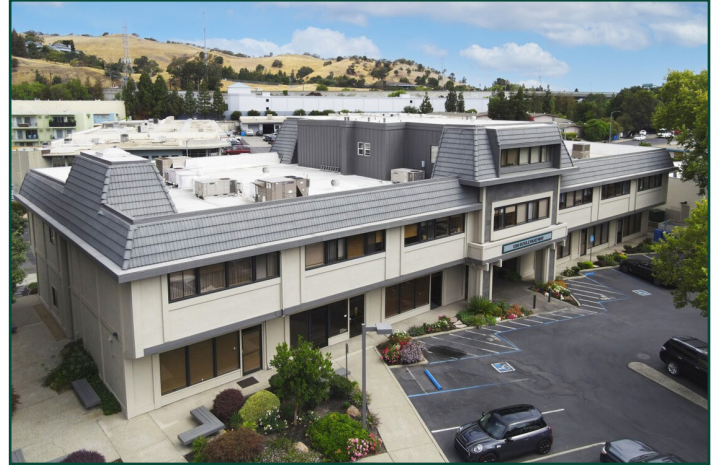
1280 Boulevard Way Walnut Creek, CA