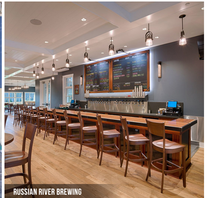
RUSSIAN RIVER BREWING