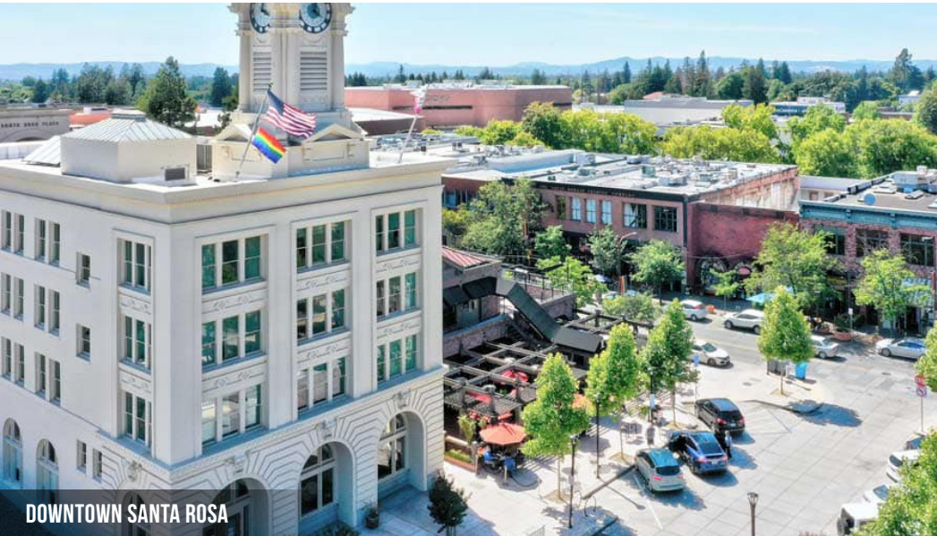
DOWNTOWN SANTA ROSA