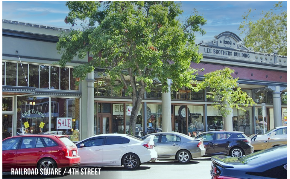
RAILROAD SQUARE / 4TH STREET