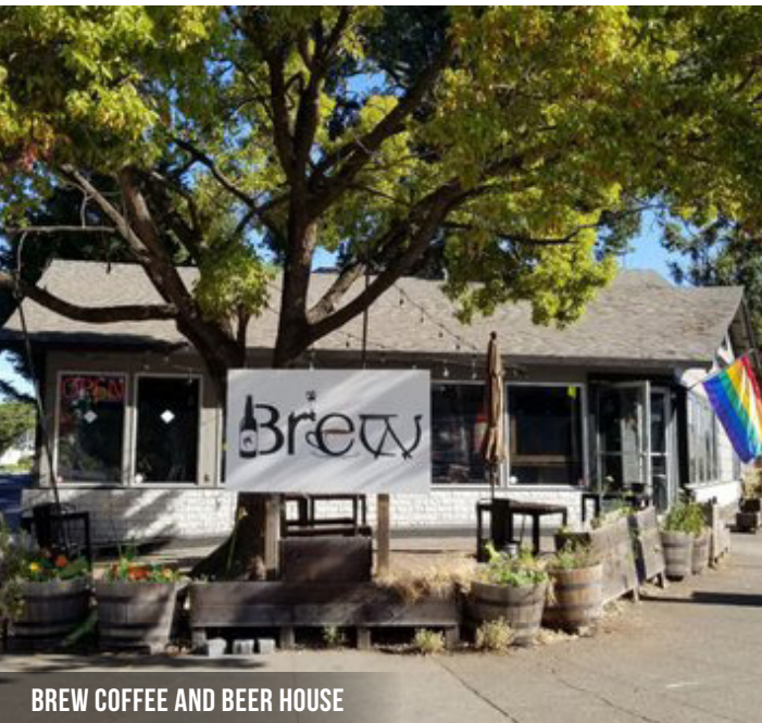
BREW COFFEE AND BEER HOUSE