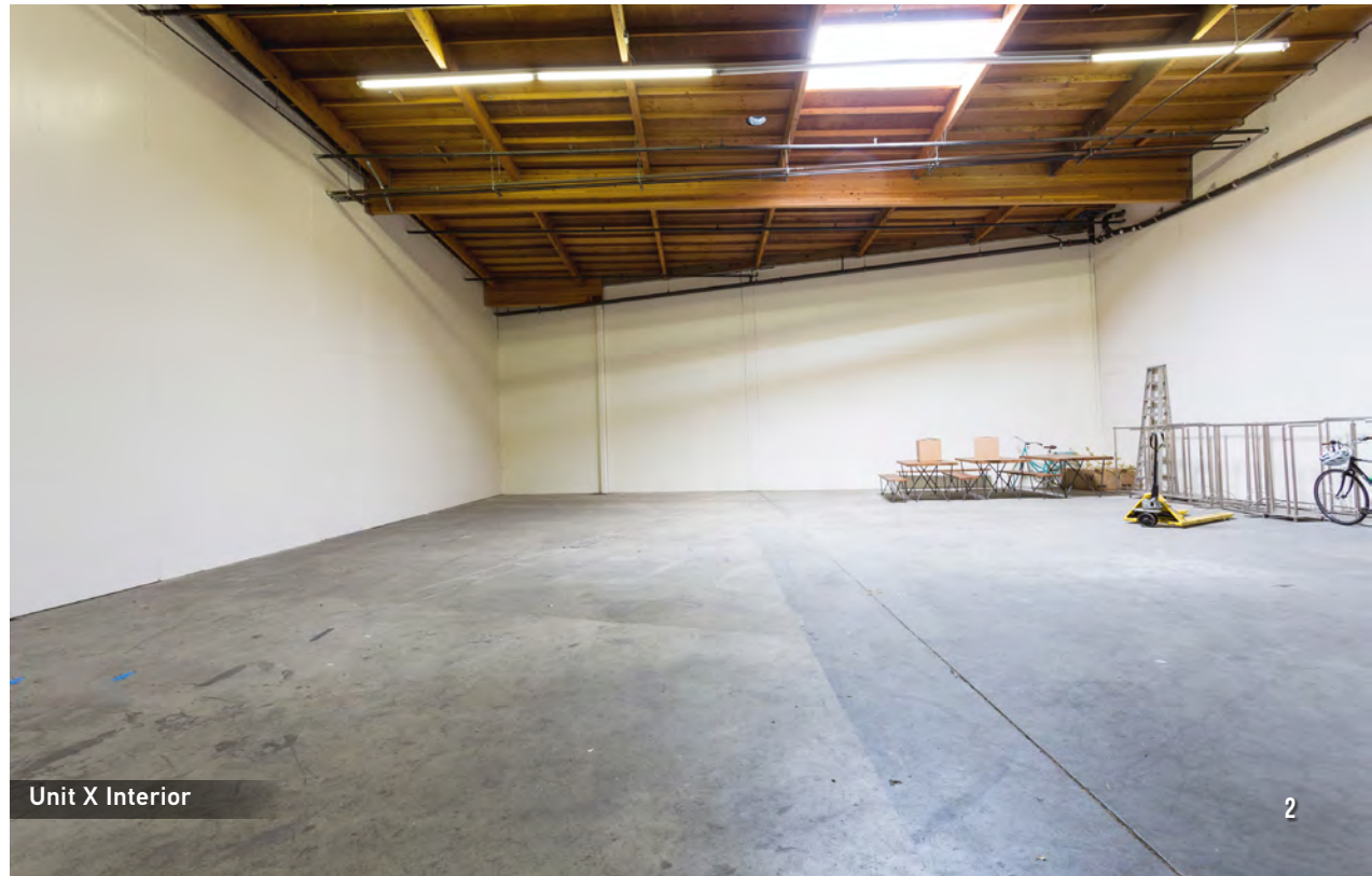
Unit X Interior