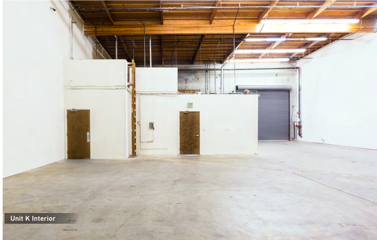
Unit K Interior