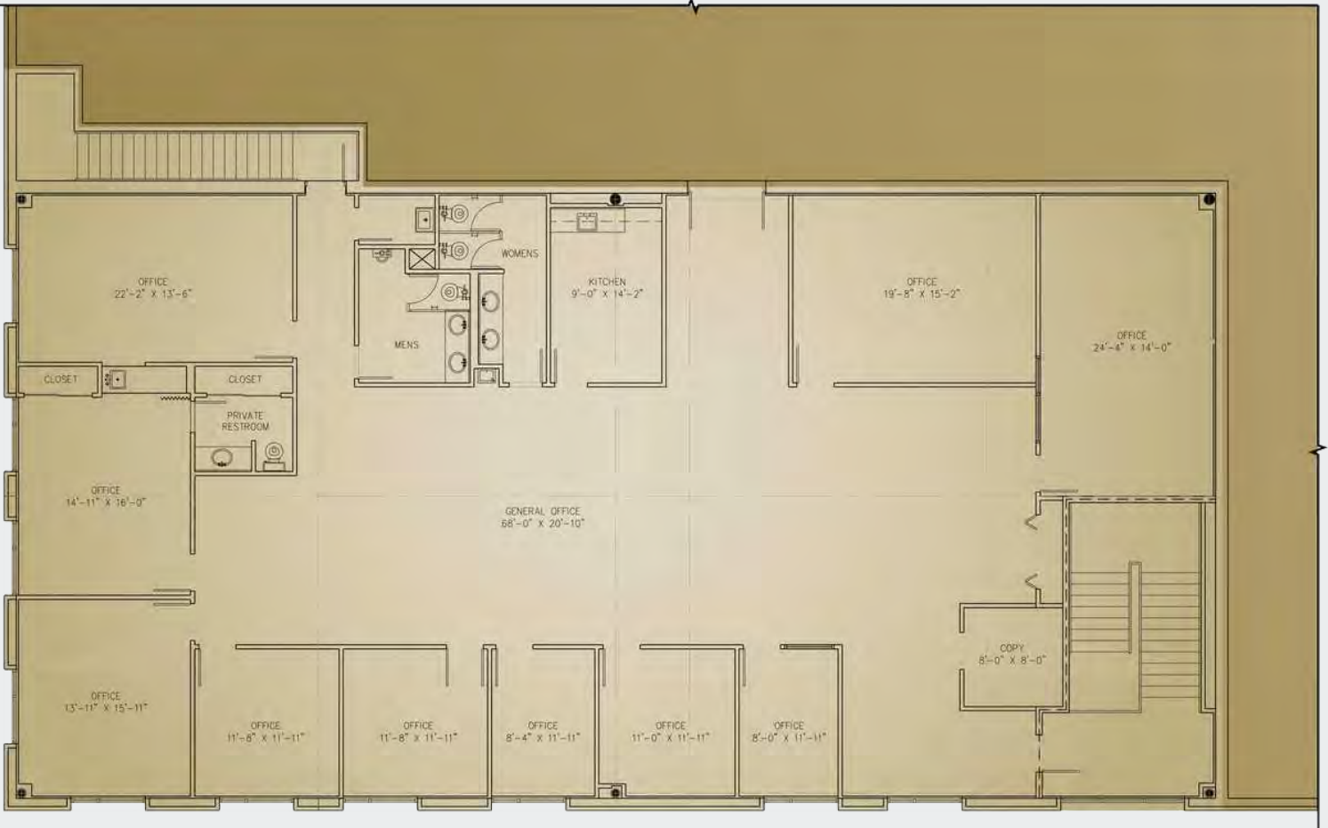
OFFICE AREA 1/4"=1'-0"